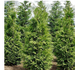
(24) GREEN GIANT ARBOVITAE