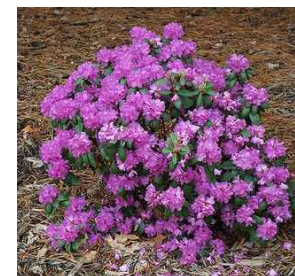
(17) P.J.M. RHODODENDRON