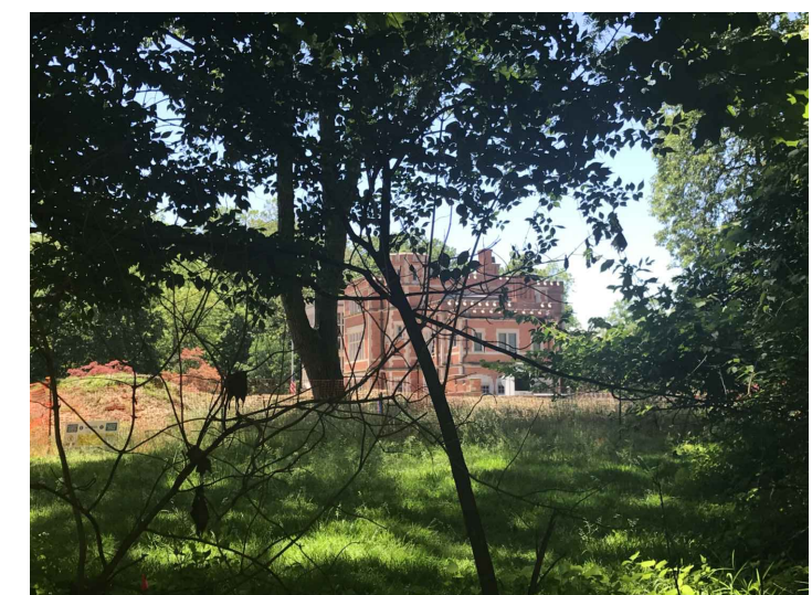
VIEW FROM OLSEN HOME TO JEFFERY MANSION