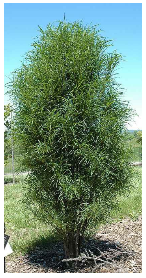
FINE LINE BUCKTHORN