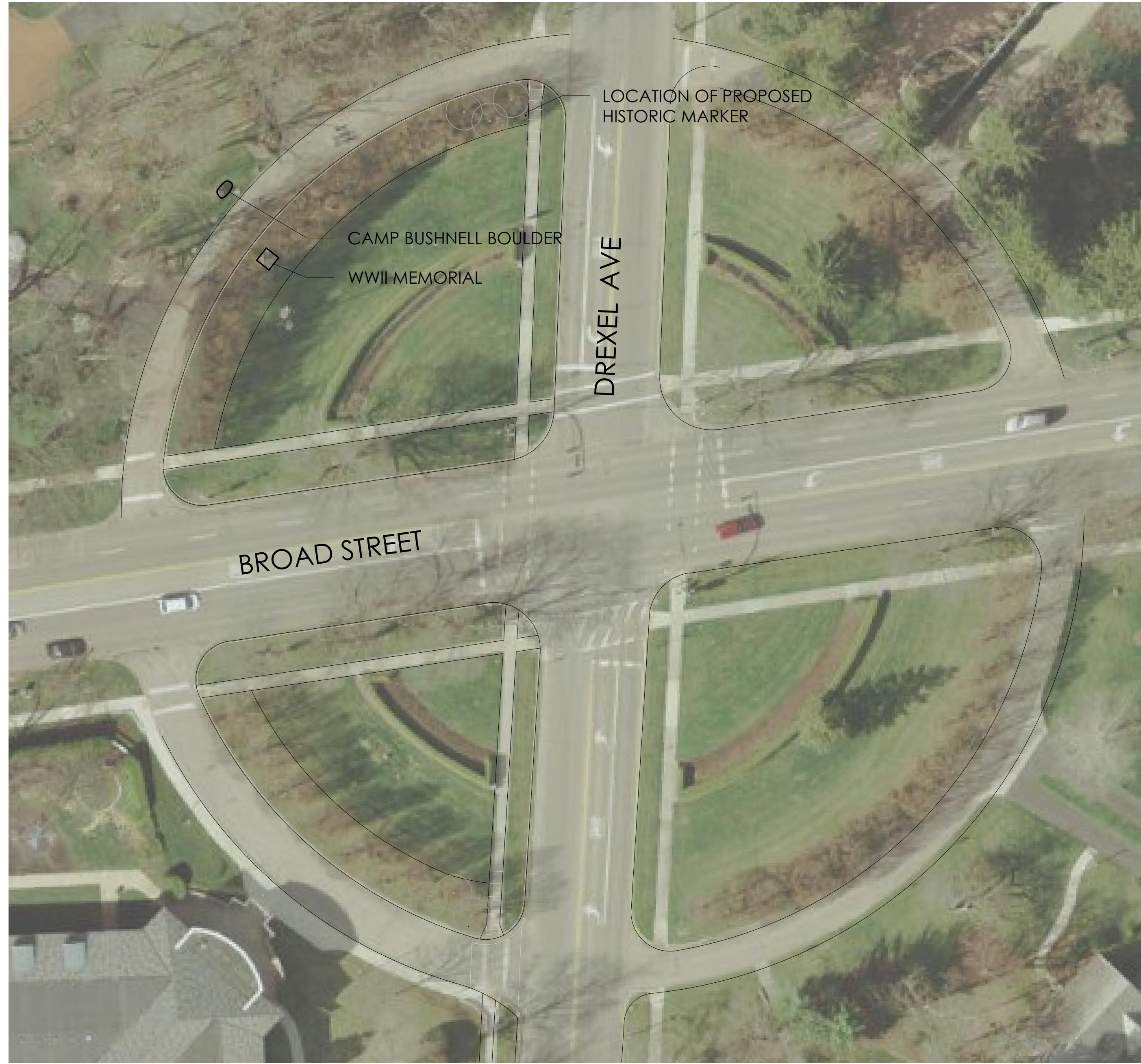
1 SITE PLAN SCALE: 1" = 30' - 0"