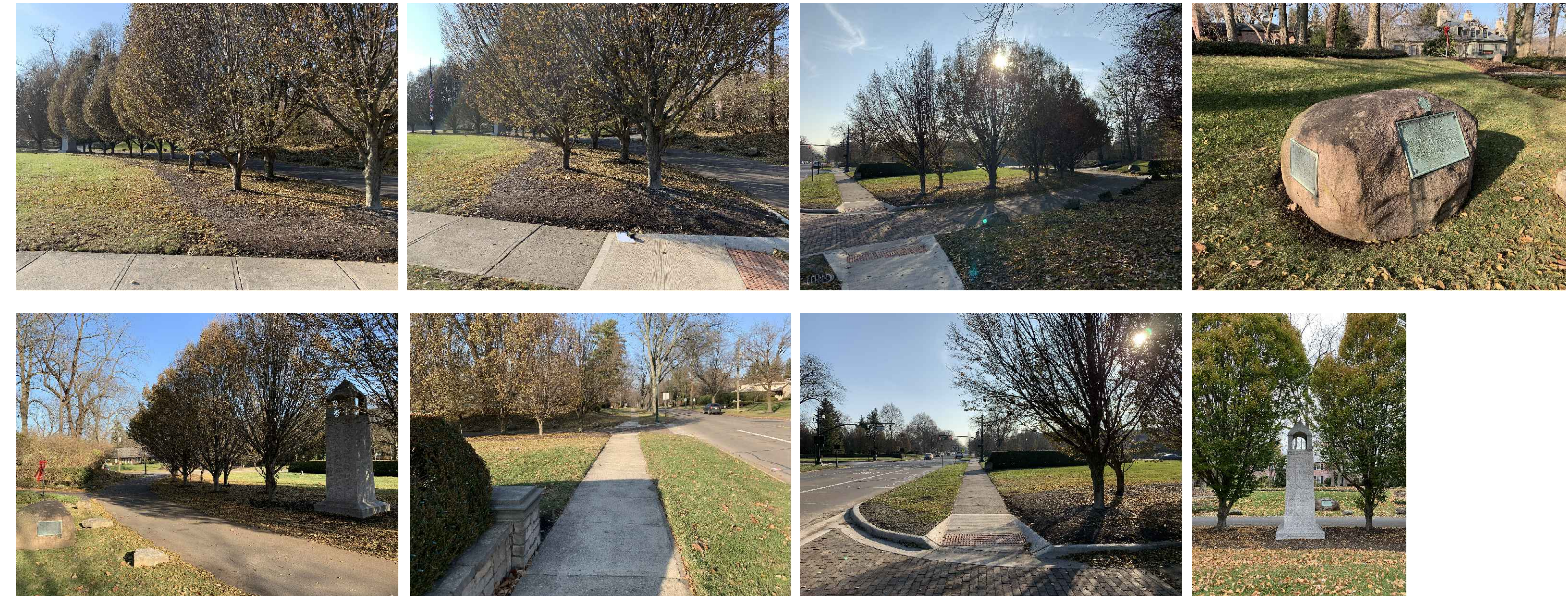
2 EXISTING SITE PHOTOS SCALE: N/A