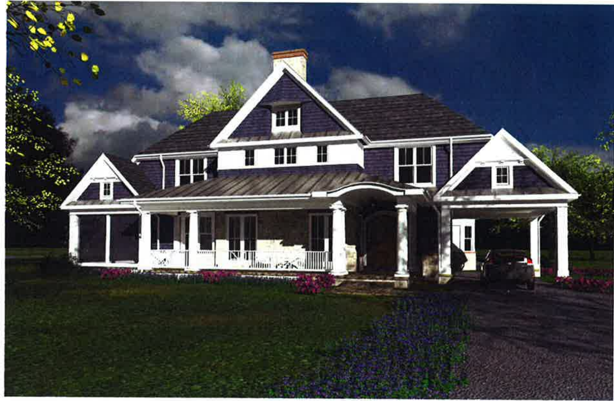
ALTERNATE SHAKE COLOR SCHEME