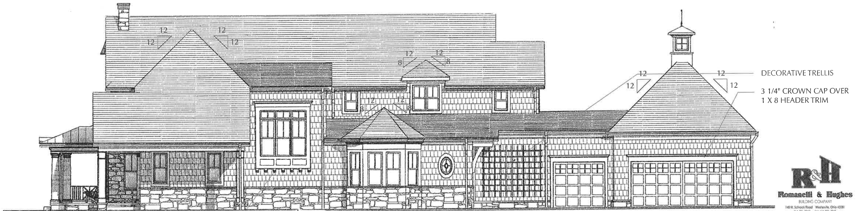
SIDE (SOUTH) ELEVATION