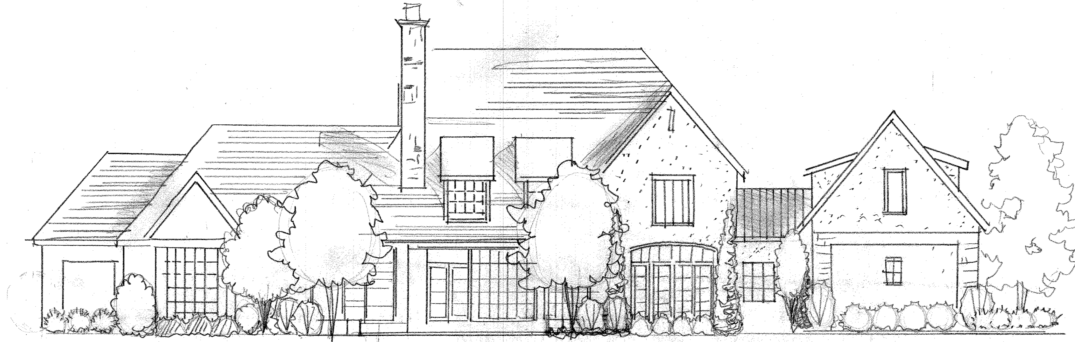
EXIST ELEVATION SCALE 1/8" = 1'-0"