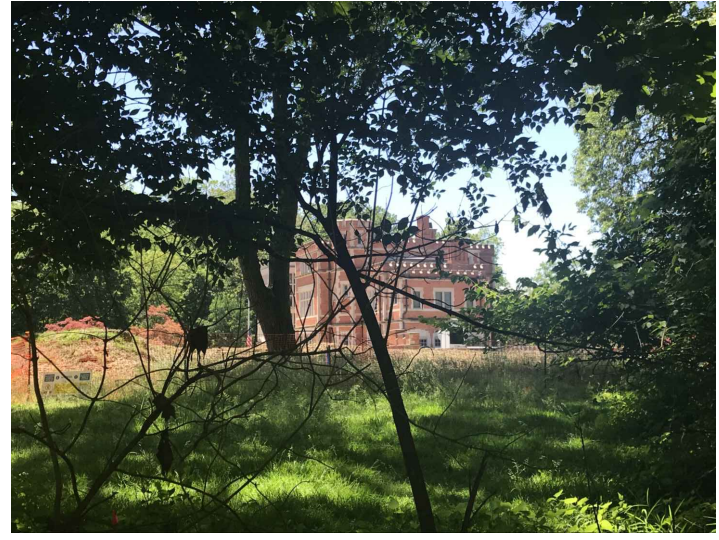
VIEW FROM OLSEN HOME TO JEFFERY MANSION