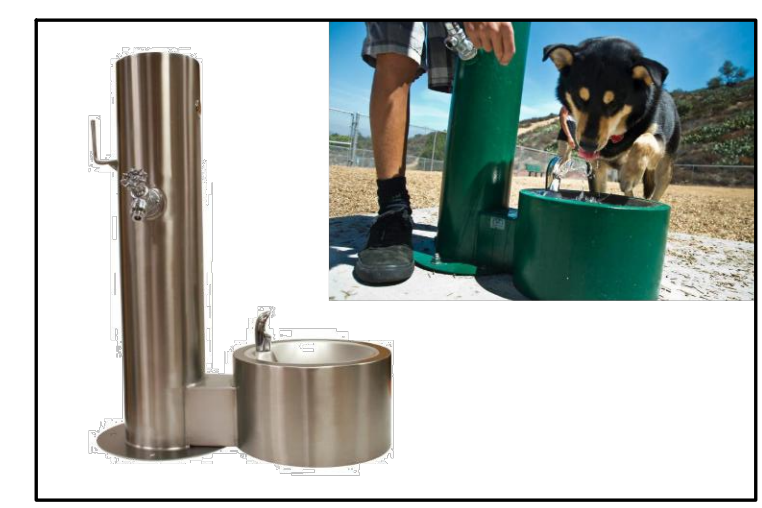
4 INSPIRATIONAL IMAGES SCALE: NTS