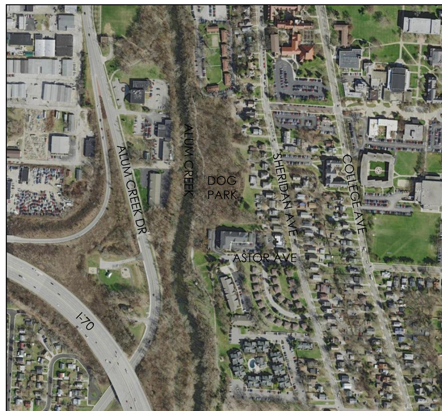
2 CONTEXT AERIAL SCALE: NTS