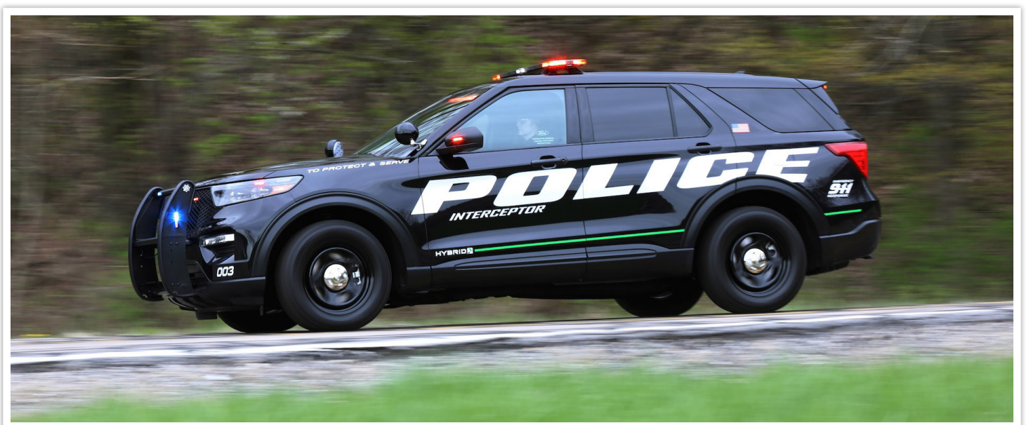
The 2020 Police Interceptor hybrid will save 1,276 gallons of fuel per year per vehicle.

For many years, Bexley has been researching clean fleet options across all city vehicles. Police cruisers have specific requirements and capacity needs, making it especially difficult to retrofit standard passenger vehicles for police purposes. In 2019, Ford announced a hybrid police cruiser, and Bexley's 2020 cruiser replacements will consume less fuel, rely less on engines for idling, and result in a net savings to the City. Each hybrid interceptor is projected to reduce fuel consumption by 1,276 gallons per year, resulting in a savings of 22,560 pounds of CO 2 , with a carbon sequestration equivalency of 188 trees.