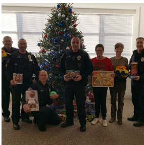
Officers and alumnae of the Bexley Citizens Police Academy with gifts for

This program provides an opportunity for children and students to learn more about pedestrian and bike safety. At Cross with a Cop, participants learned about Bexley's helmet laws, sidewalk safety, and how to properly cross a busy intersection.