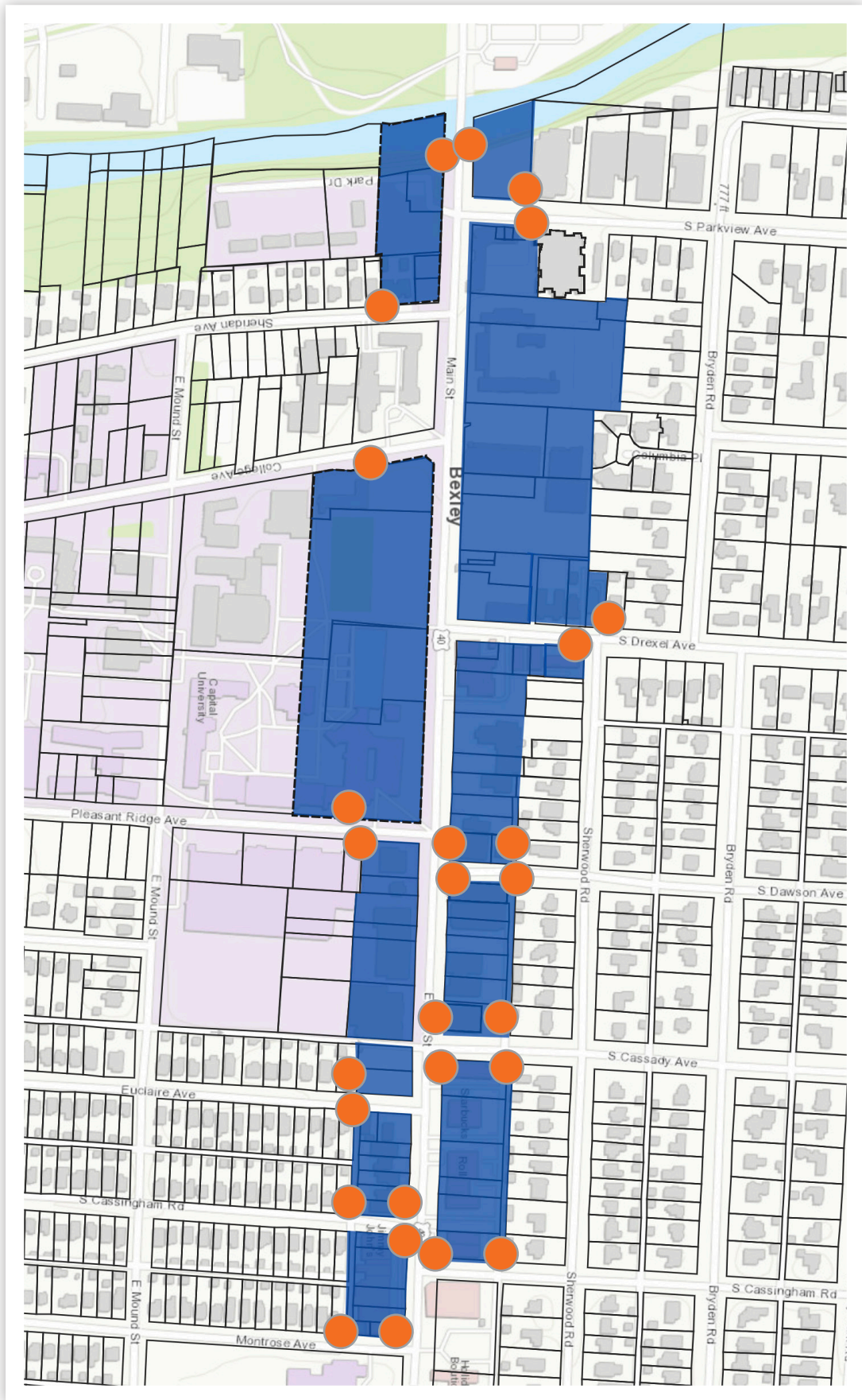
EXHIBIT "B" SIGNAGE LOCATION MAP