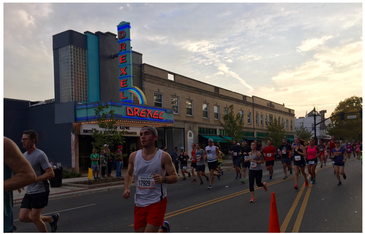
Sunday's Columbus Marathon runners running down Main Street