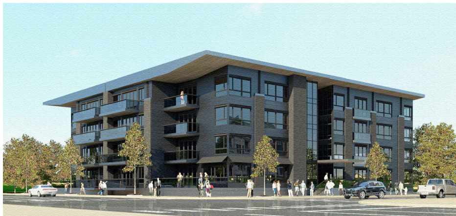
VIEW FROM E. MAIN & PARKVIEW

The proposal calls for an approximately $10m, 26 unit apartment building. The site currently generates approximately $14k in property taxes, and is projected to generate $133k in tax revenues from property tax, City income tax, and School District Income Tax upon completion and occupancy, assuming 70% abatement of residential units. The development as proposed would not meet the criteria for the 100% abatement program. Commission members discussed the architecture, positioning on the site, parking logistics, and relationship to Alum Creek riparian corridor. Application tabled for March meeting to accommodate plan revisions.