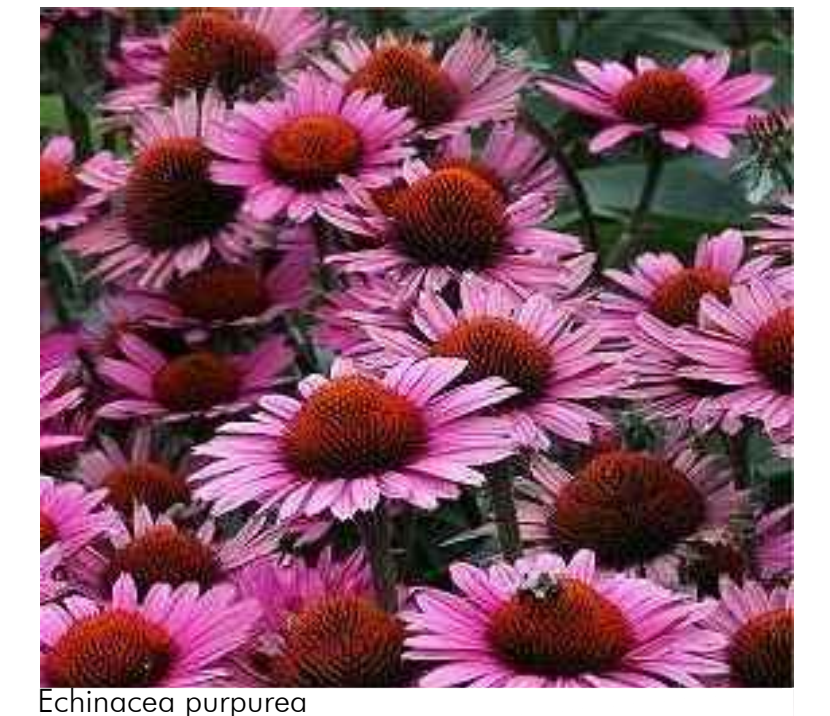
Echinacea purpurea Coneflower