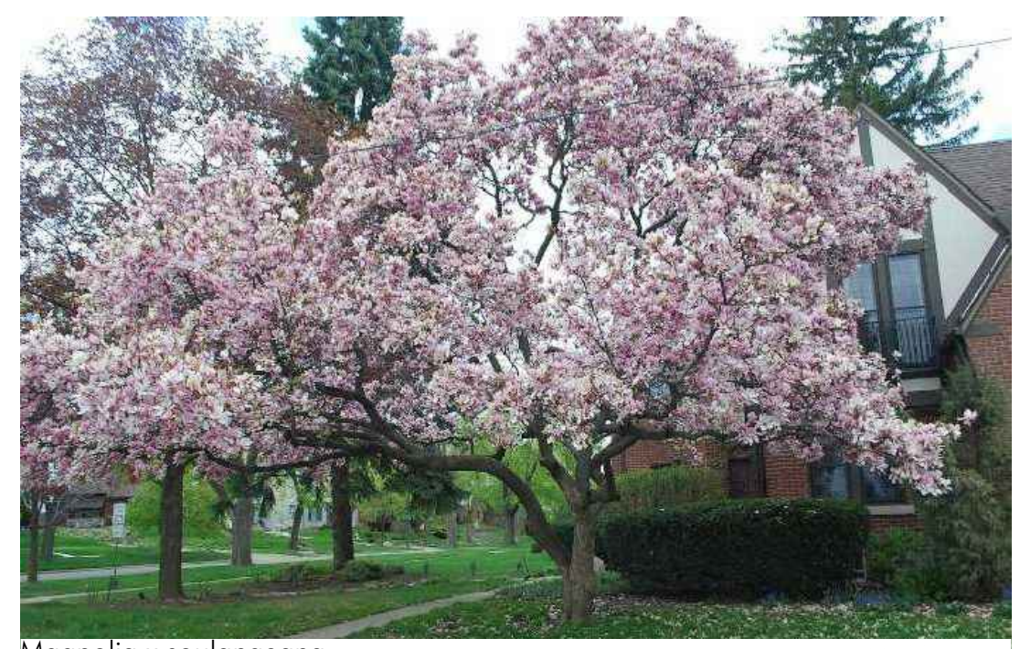
Magnolia x soulangeana Saucer Magnolia