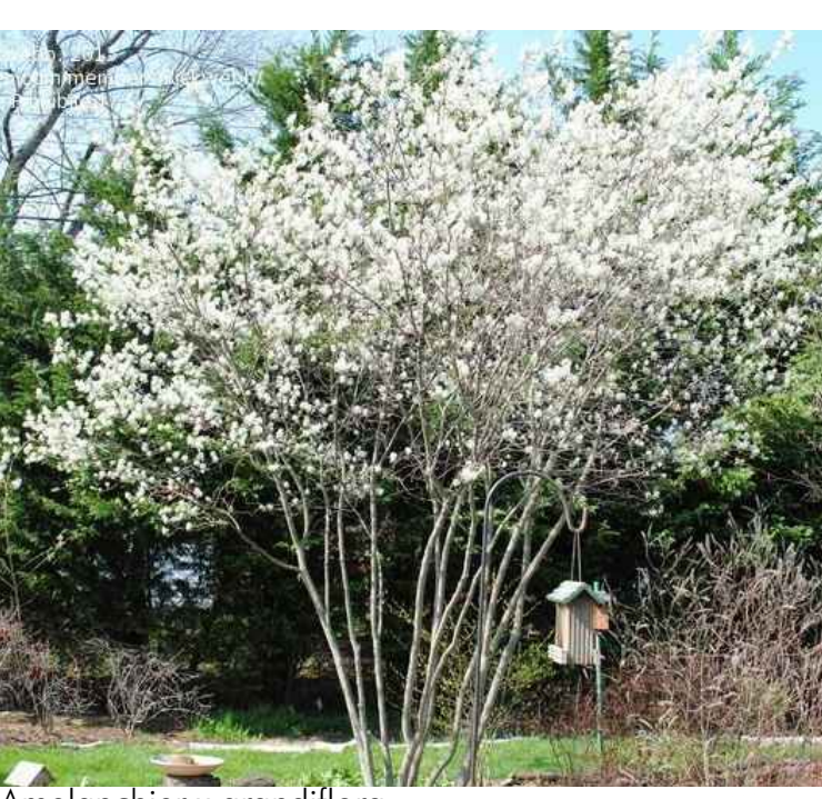
Amelanchier x grandiflora Serviceberry