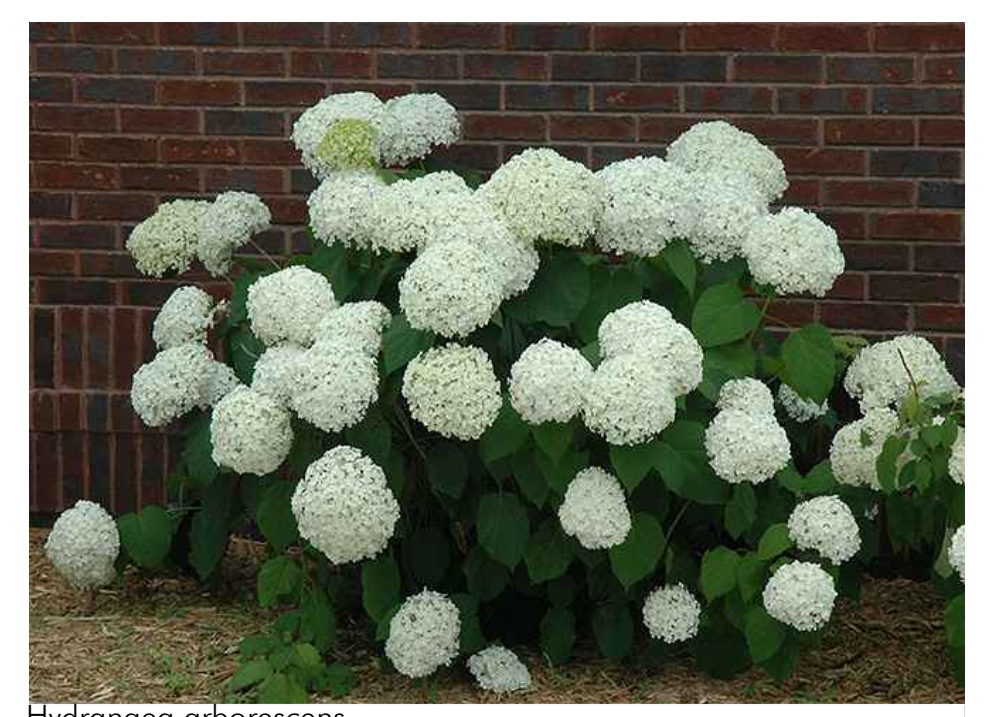
Hydrangea arborescens Hydrangea