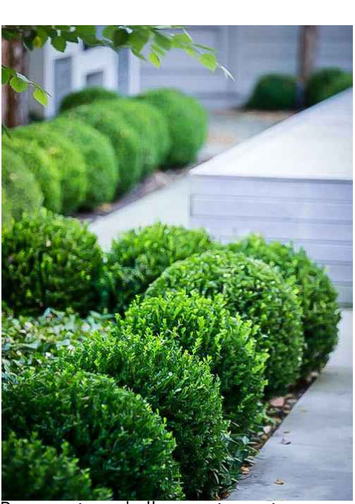
Buxus microphylla var. japonica Boxwood