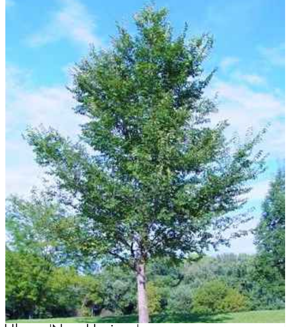
Ulmus 'New Horizon New Horizon Elm