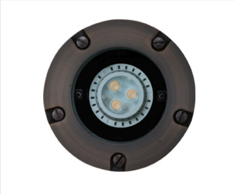
IN-GROUND WELL LIGHT