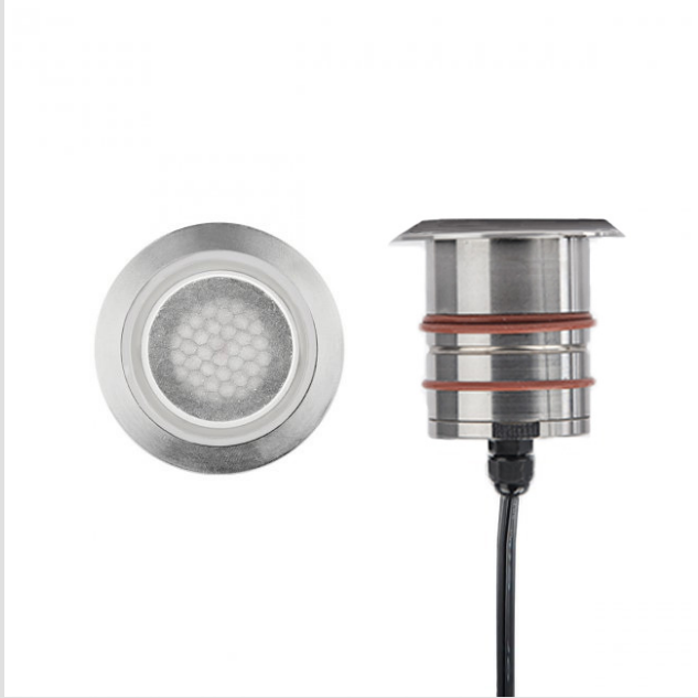
IN-GROUND WELL LIGHT