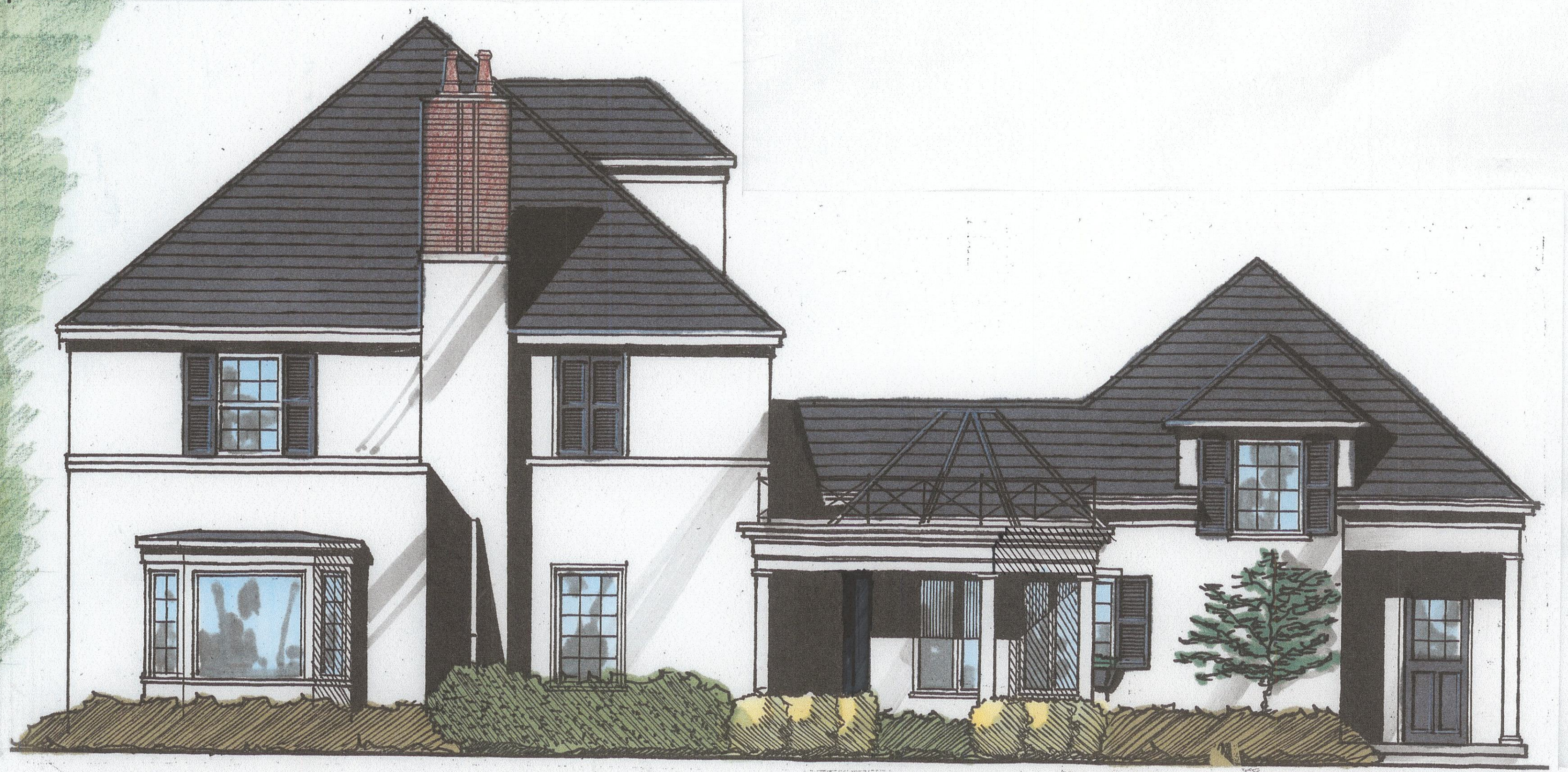
South Elevation 1/4" = 1'-0"

PETE FOSTER Residential Design Hadley Residence 90 North Columbia Avenue Bexley, Ohio DECEMBER 9, 2020