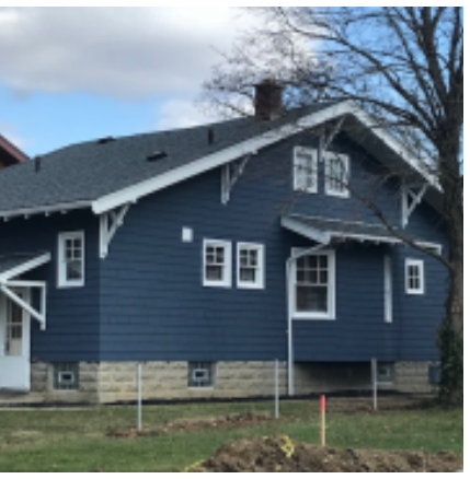
IMG_0726.jpg Feb 13, 2020