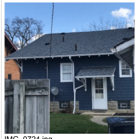
IMG_0724.jpg Feb 13, 2020