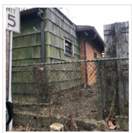
IMG_2097.jpg Feb 13, 2020