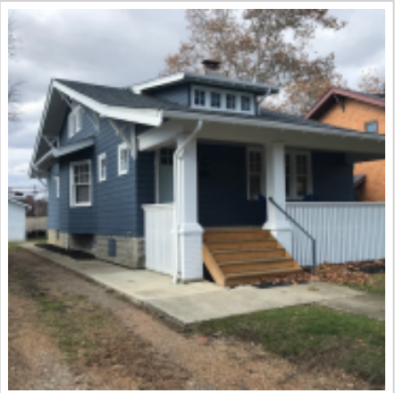
Photographs Feb 13, 2020