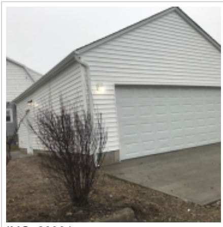
IMG_2096.jpg Feb 13, 2020