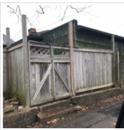
IMG_2098.jpg Feb 13, 2020