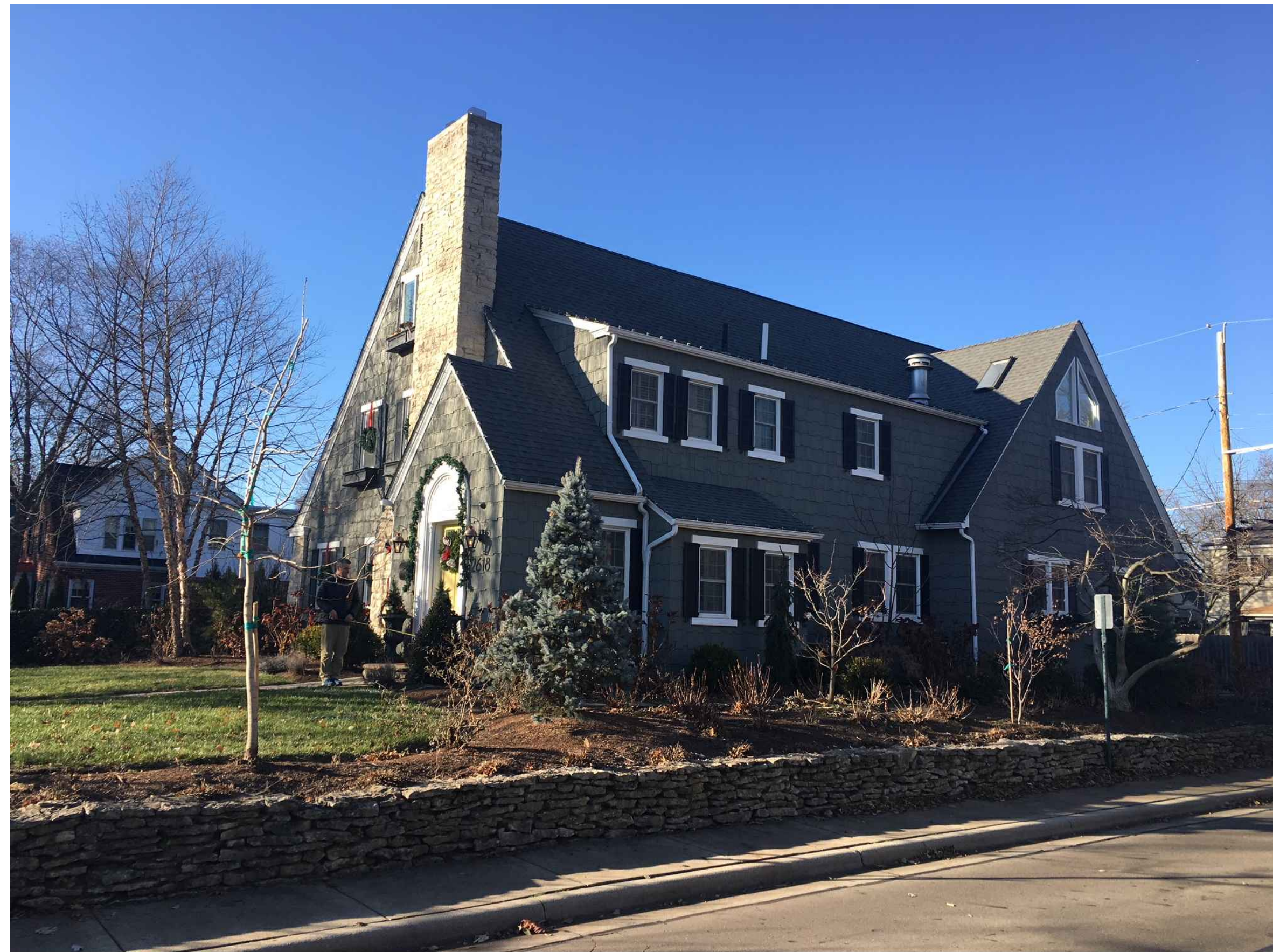
VIEW FROM SOUTH EAST