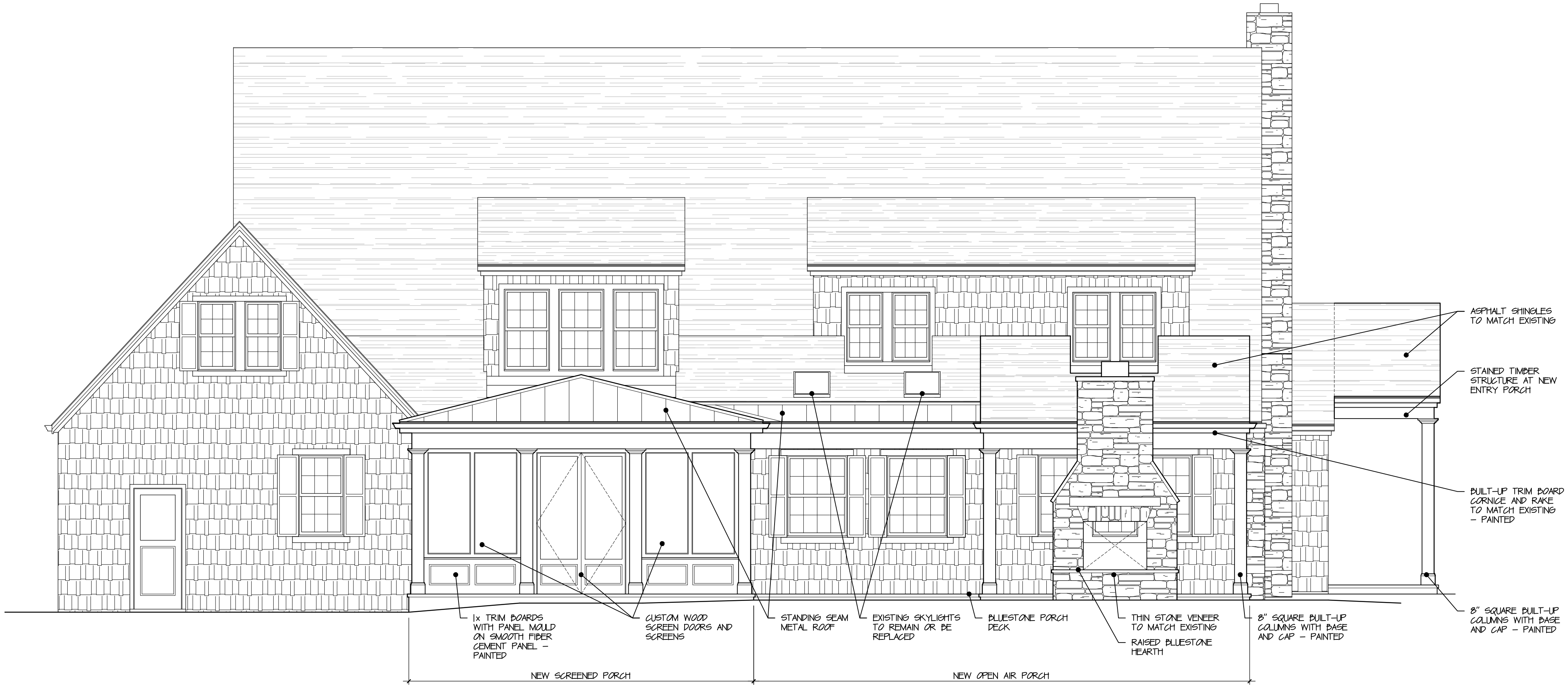
2 PROPOSED WEST ELEVATION A2.2 1/4"=1'-0"