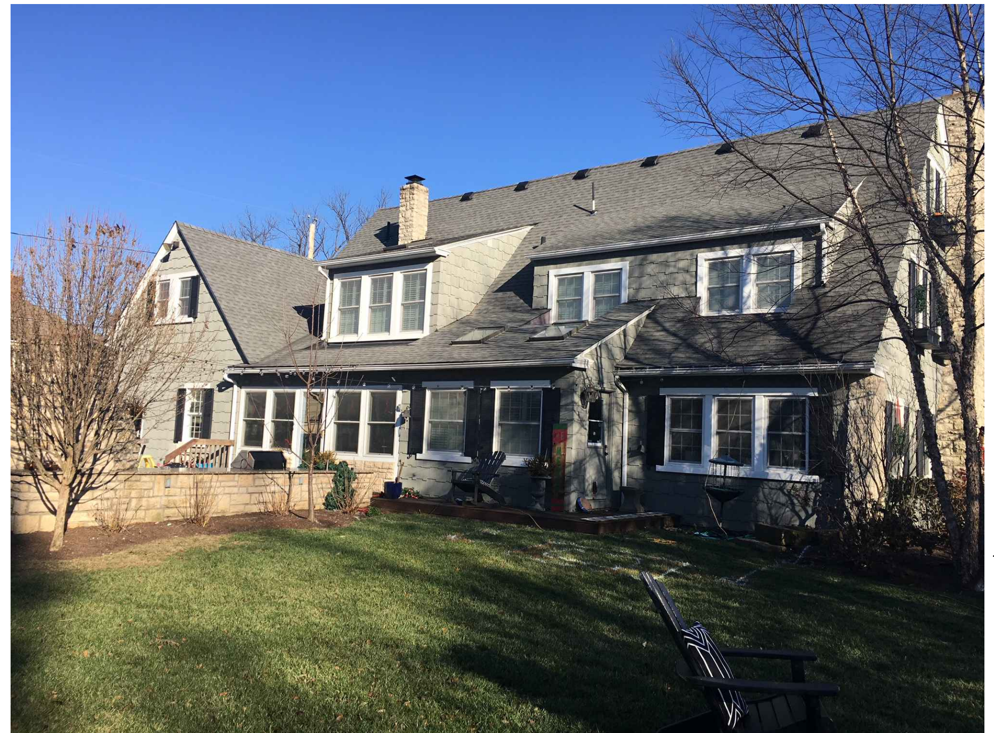
NEW FROM SOUTH WEST