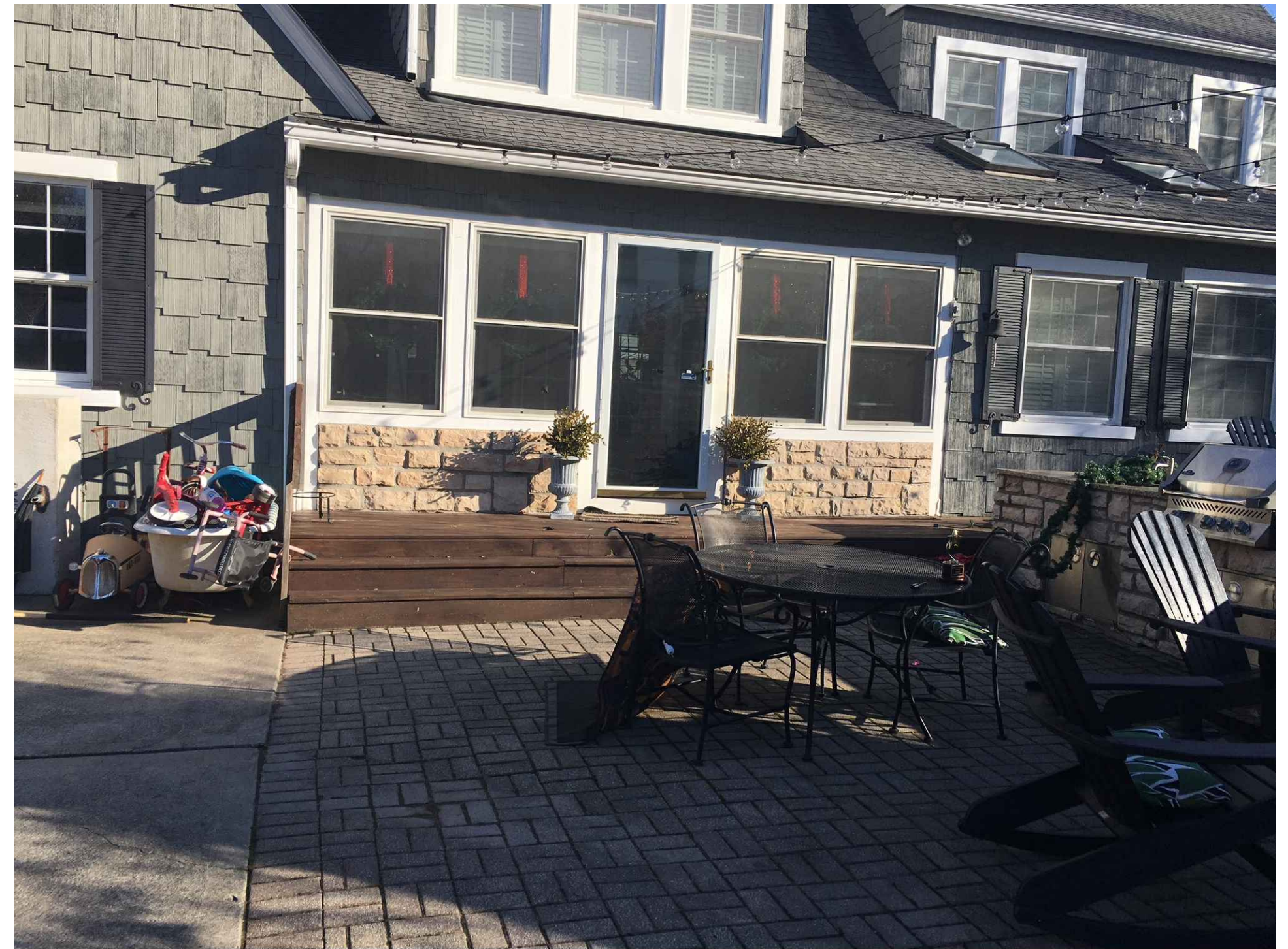
PORCH ENCLOSURE AND PATIO TO BE REMOVED