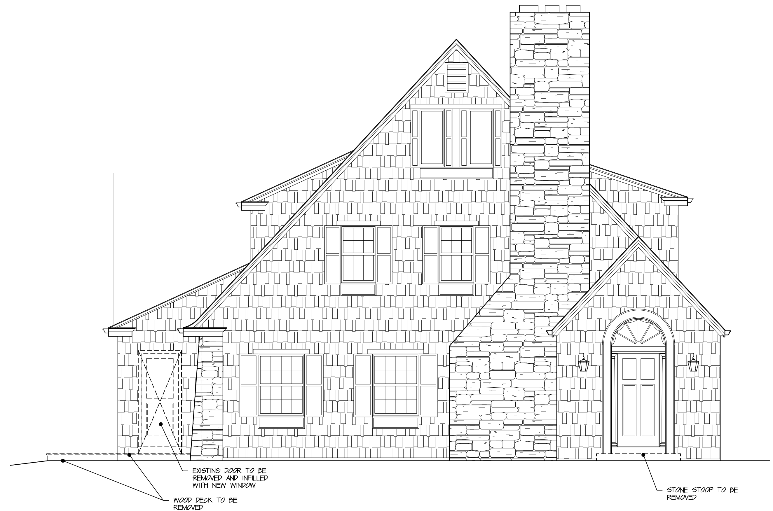
1 EXISTING SOUTH ELEVATION A2.1 1/4"=1'-0"