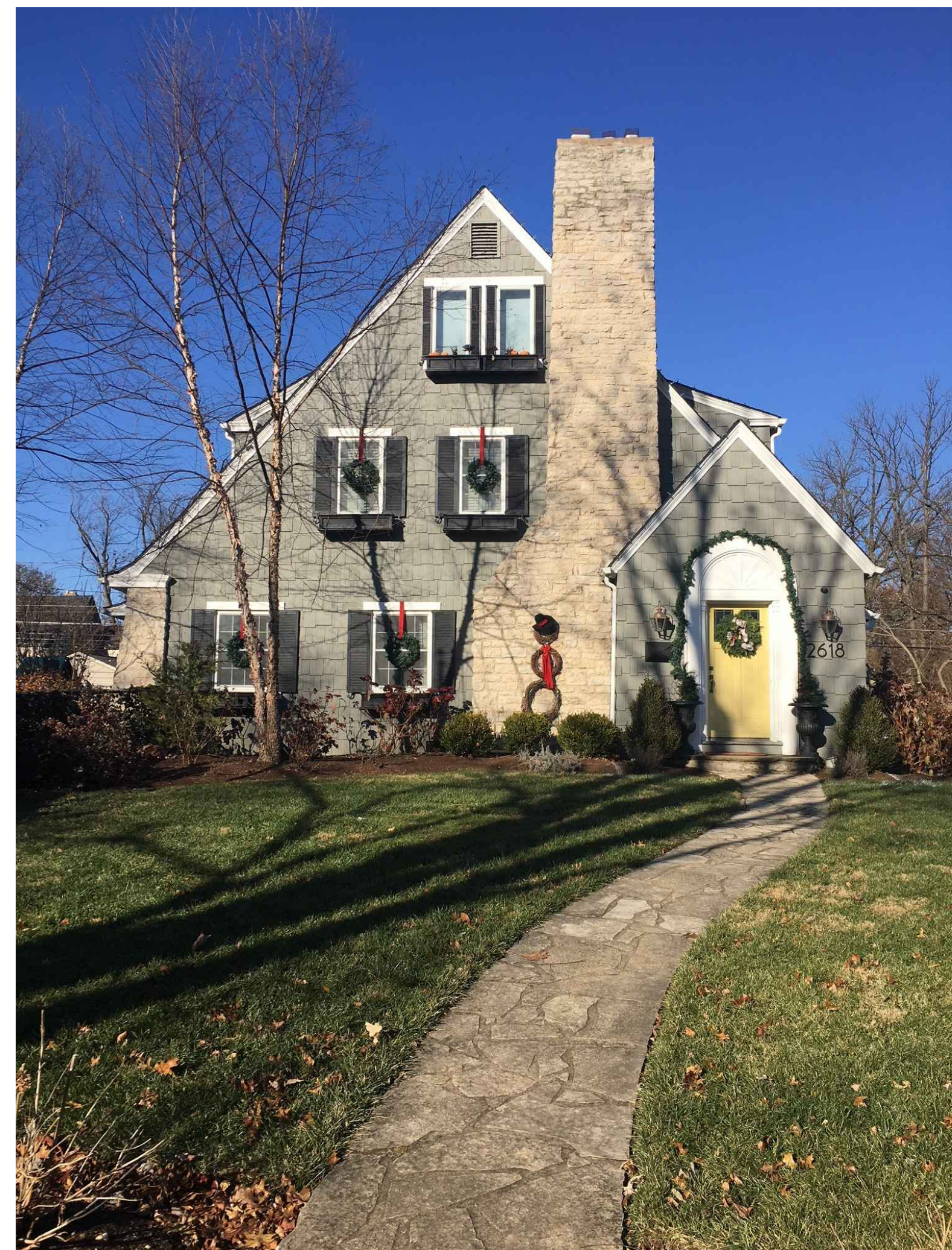
EXISTING SOUTH FACADE