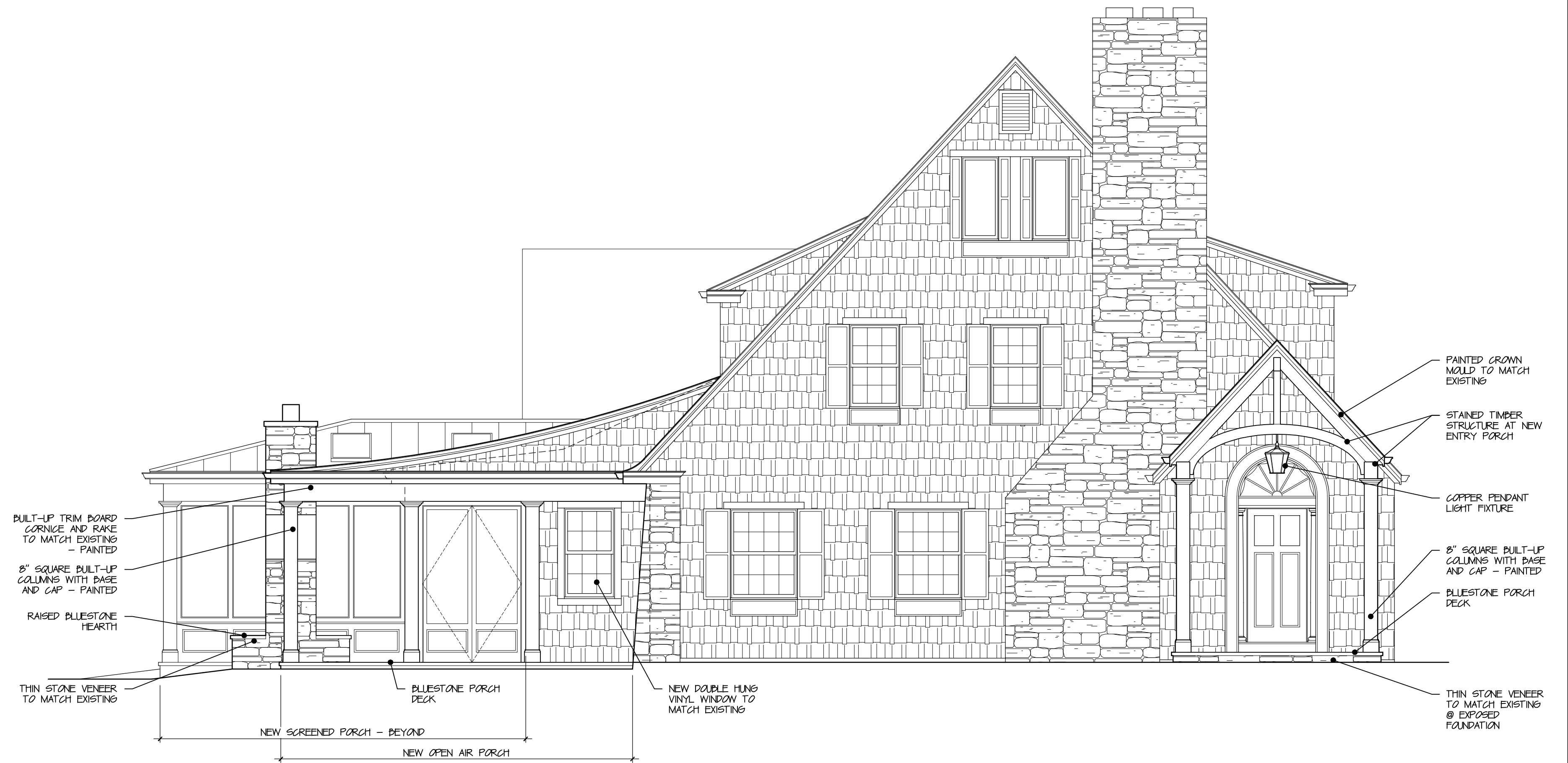
2 PROPOSED SOUTH ELEVATION A2.1 1/4"=1'-0"