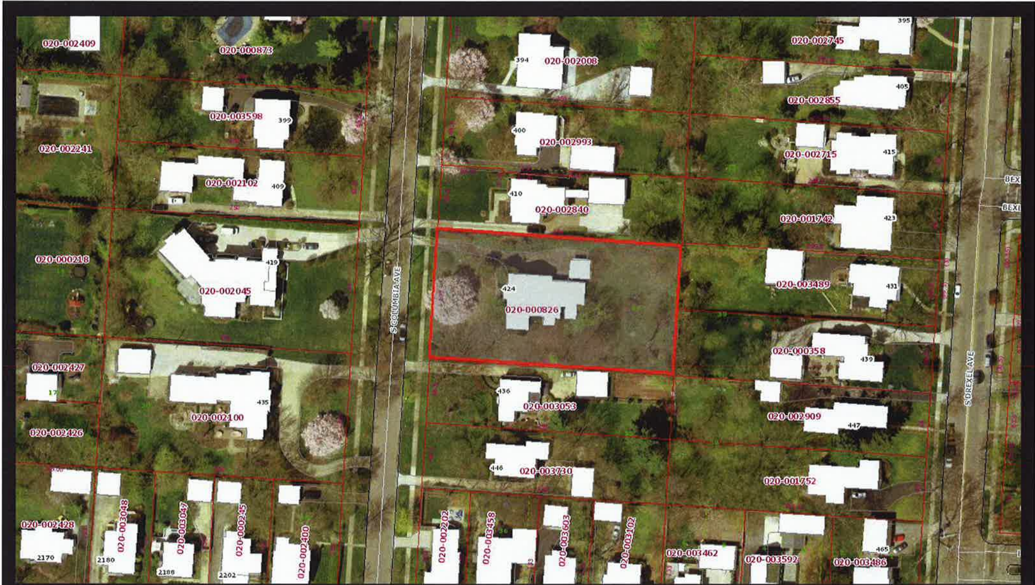
CURB CUT ANALYSIS