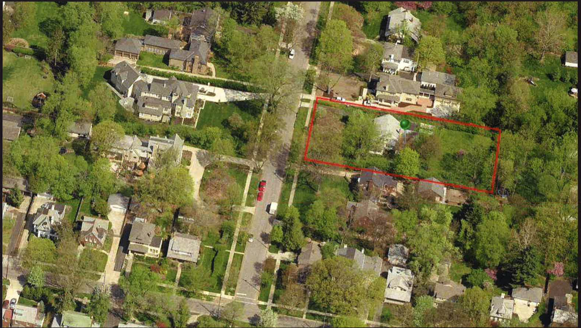
CURB CUT ANALYSIS