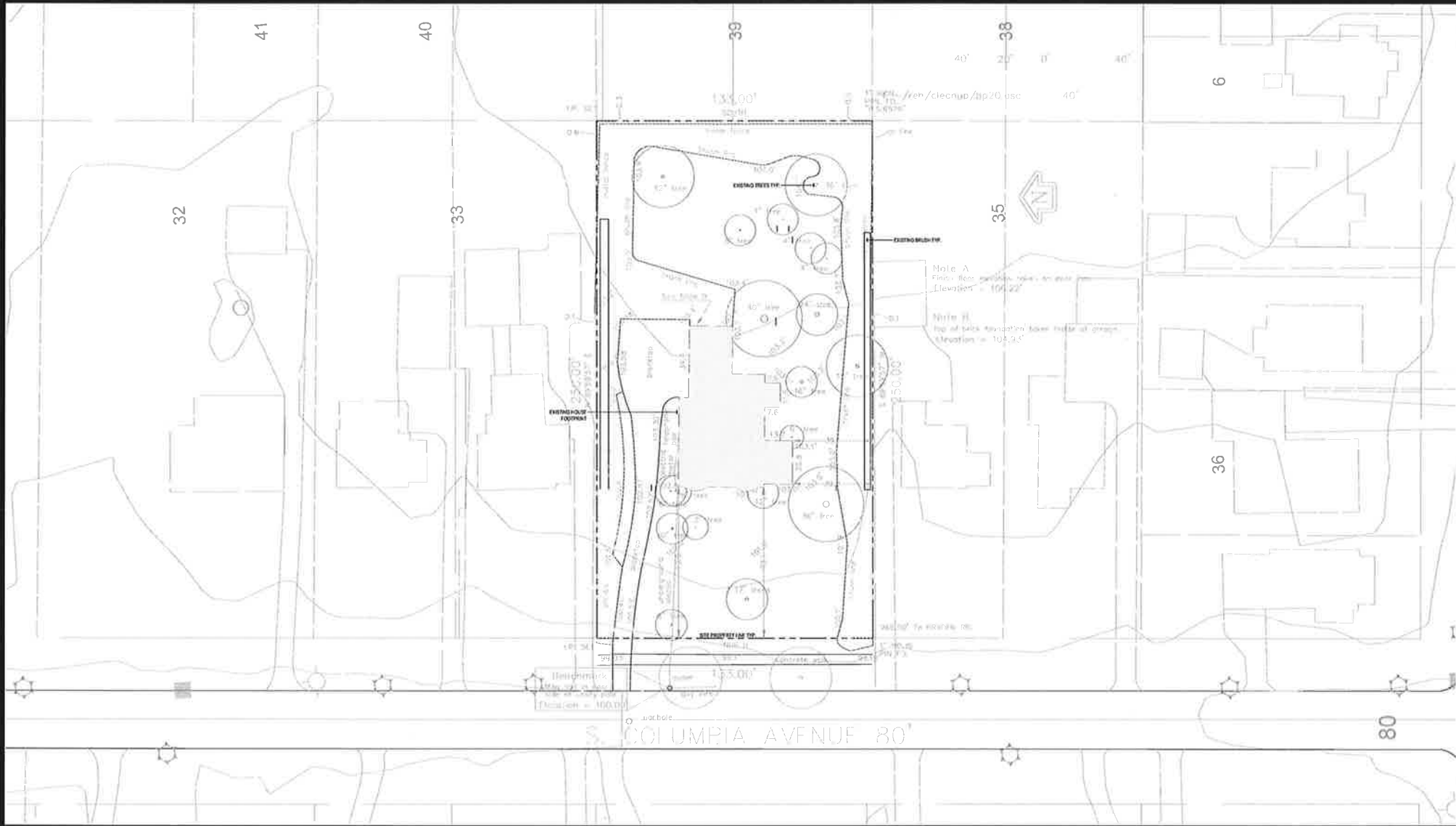
PREVIOUS ARCHITECTURAL SITE PLAN