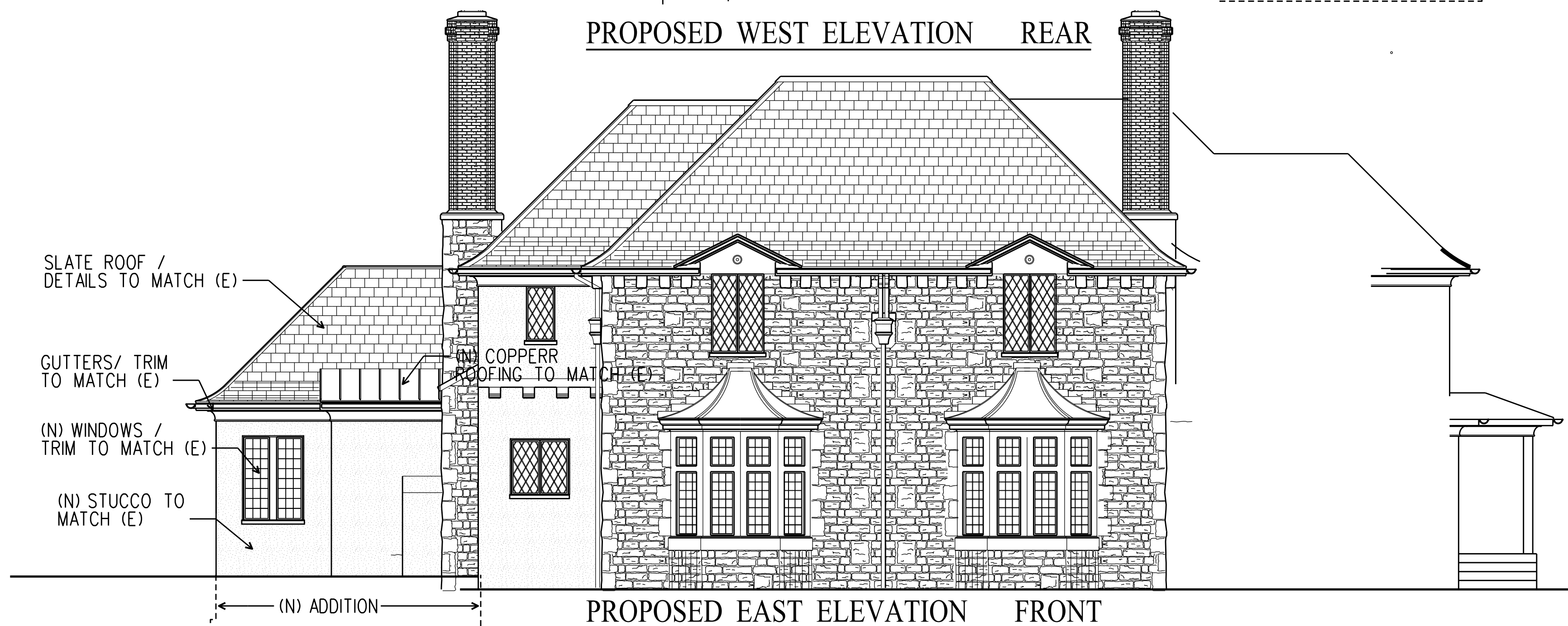
PROPOSED EAST ELEVATION FRONT