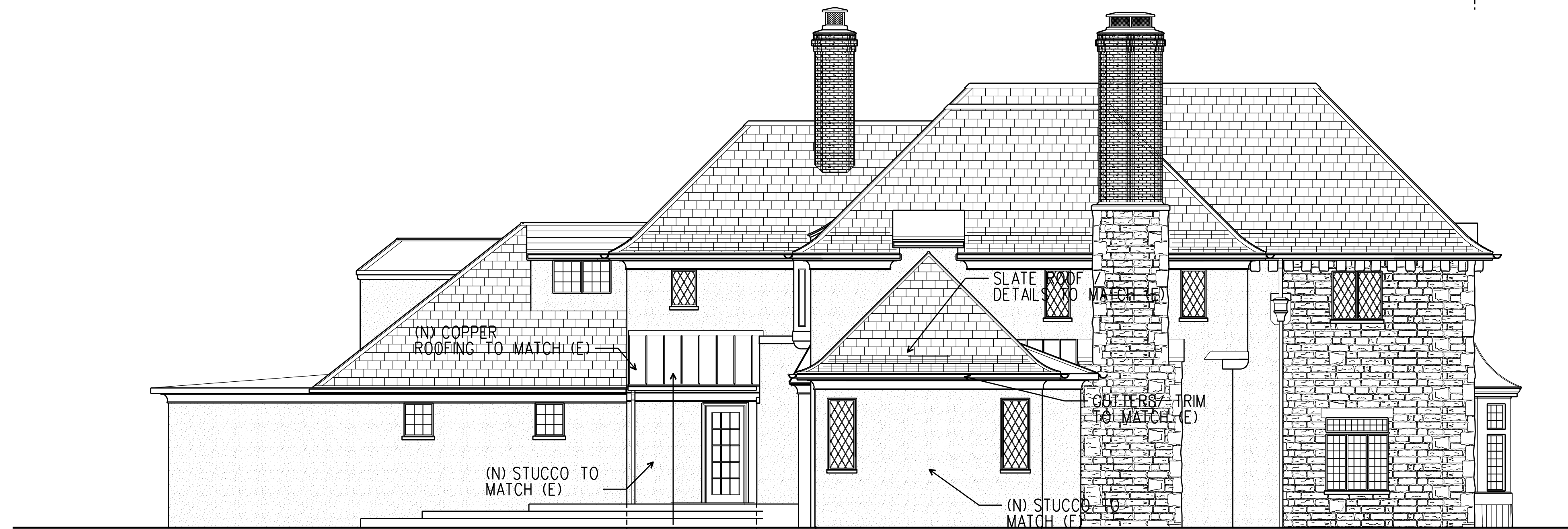
PROPOSED SOUTH ELEVATION RIGHT SIDE