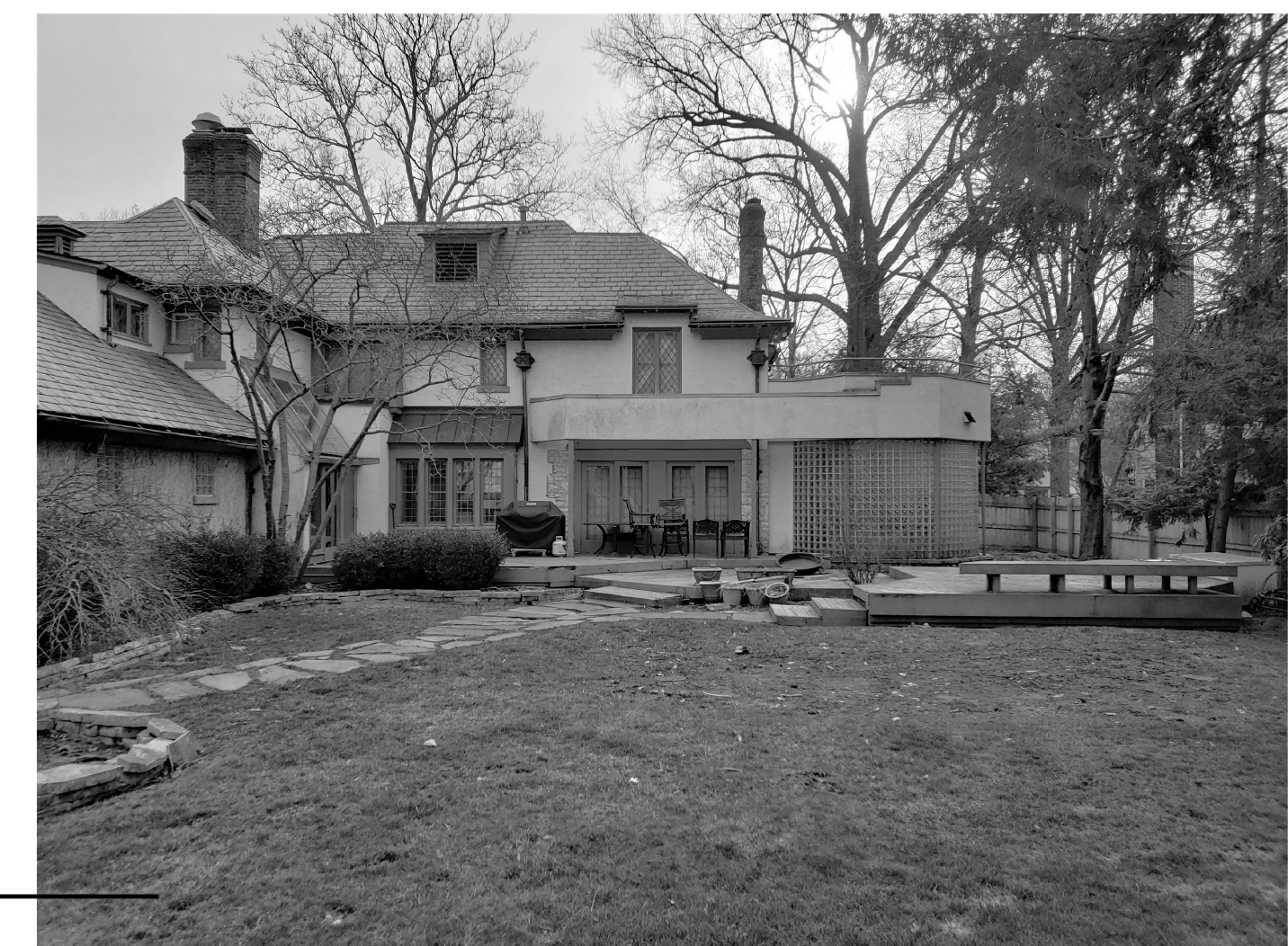
EXISTING WEST ELEVATION REAR