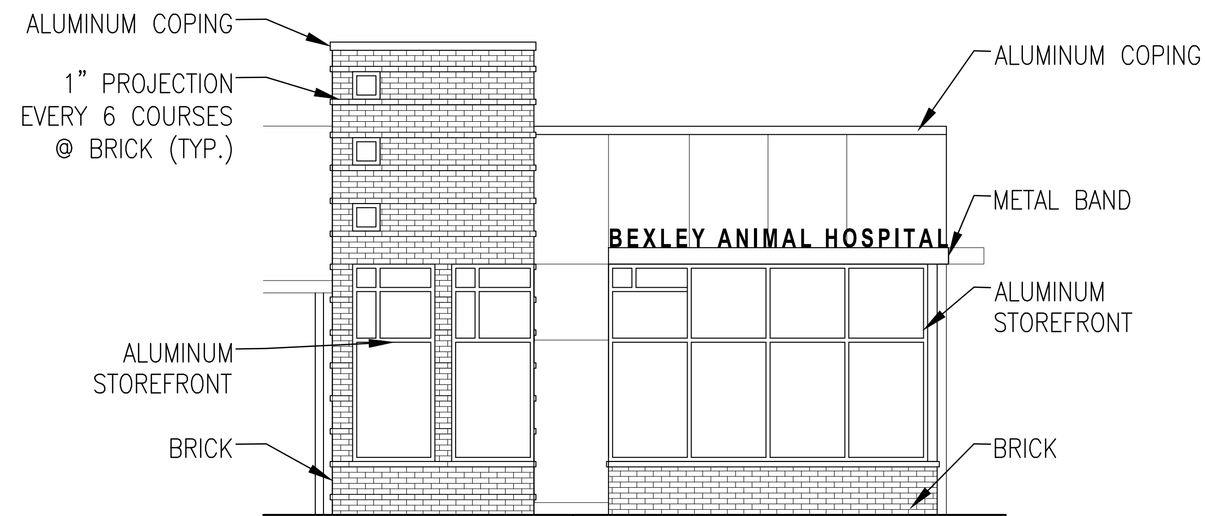
WEST ELEVATION SCALE: 1/4" = 1'-0"