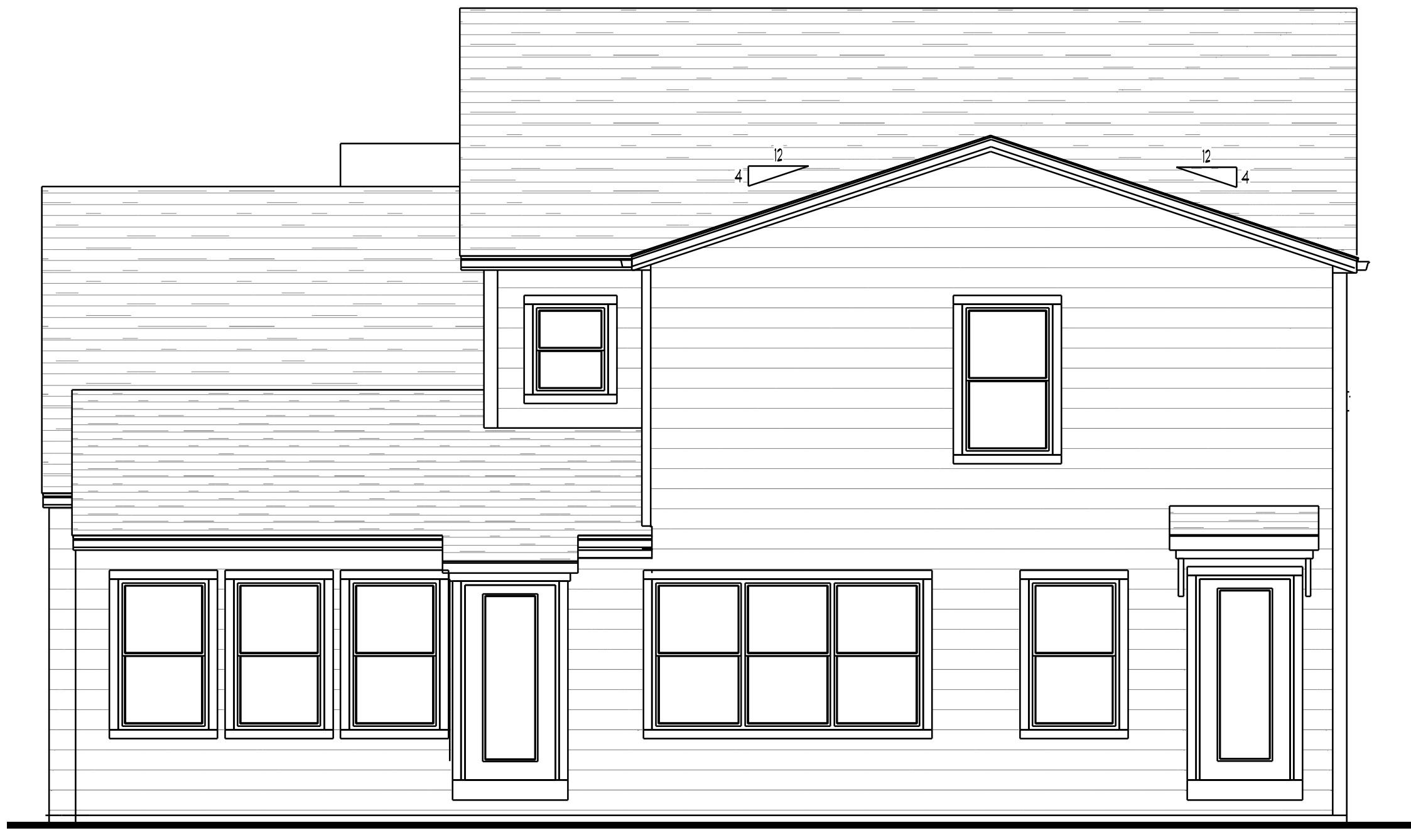
REAR ELEVATION 1/4" = 1'-0"

PRELIMINARY ONLY FOR REVIEW BY HOME OWNER. NOT THE FINISHED PRODUCT. ESTIMATING COMPARE PRICES FOR CONSTRUCTION. CONSTRUCTION FOR BUILDING PURPOSES.