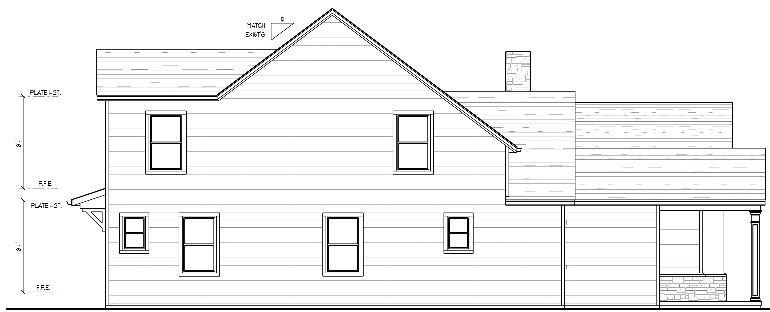
LEFT ELEVATION 1/4" = 1'-0"

Addition to Residence 334 N. Remington Bexley, Ohio Brynwood Builders