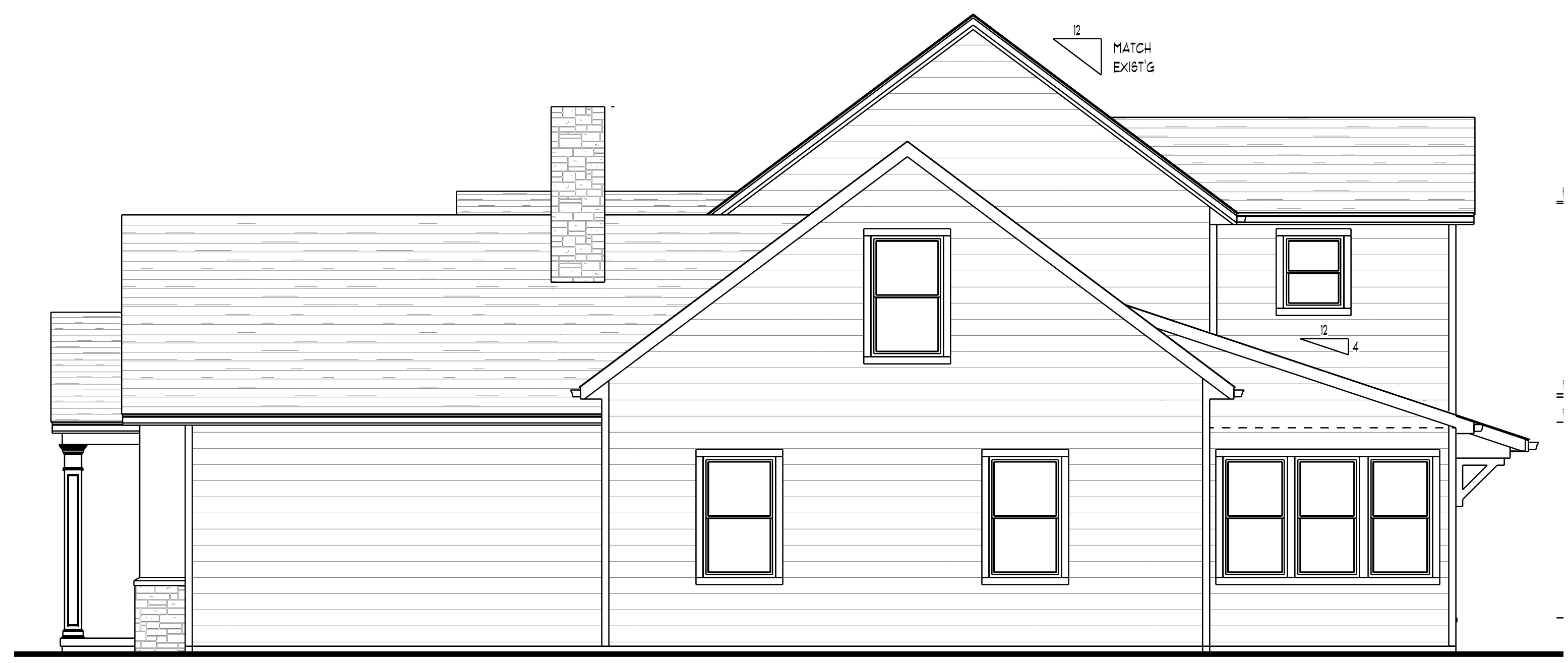
RIGHT ELEVATION 1/4" = 1'-0"

PRELIMINARY REVIEW PLANS NOT FOR CONSTRUCTION DATE: 3-4-2019