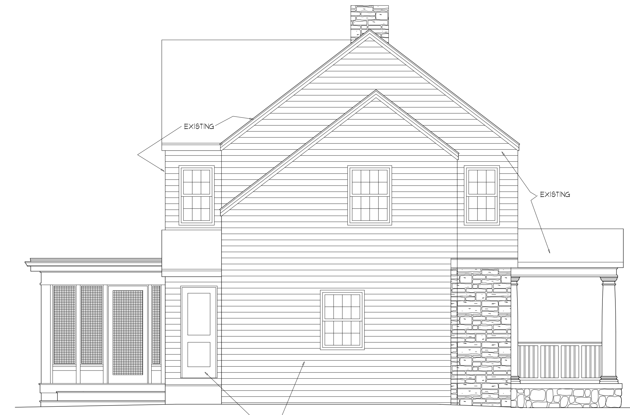
WEST - LEFT ELEV. 1/4" = 1'-0" DECK AND SCREEN NOT SHOWN