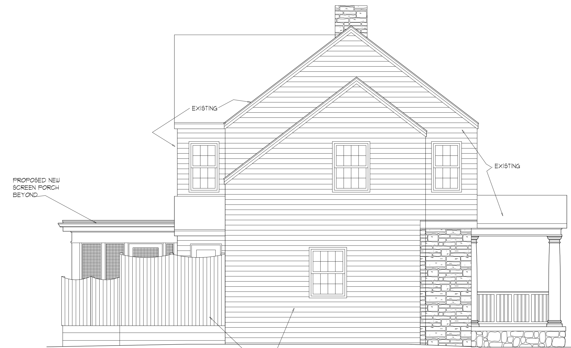
WEST-LEFT ELEV. 1/4" = 1'-0" SHOWING DECK AND SCREEN