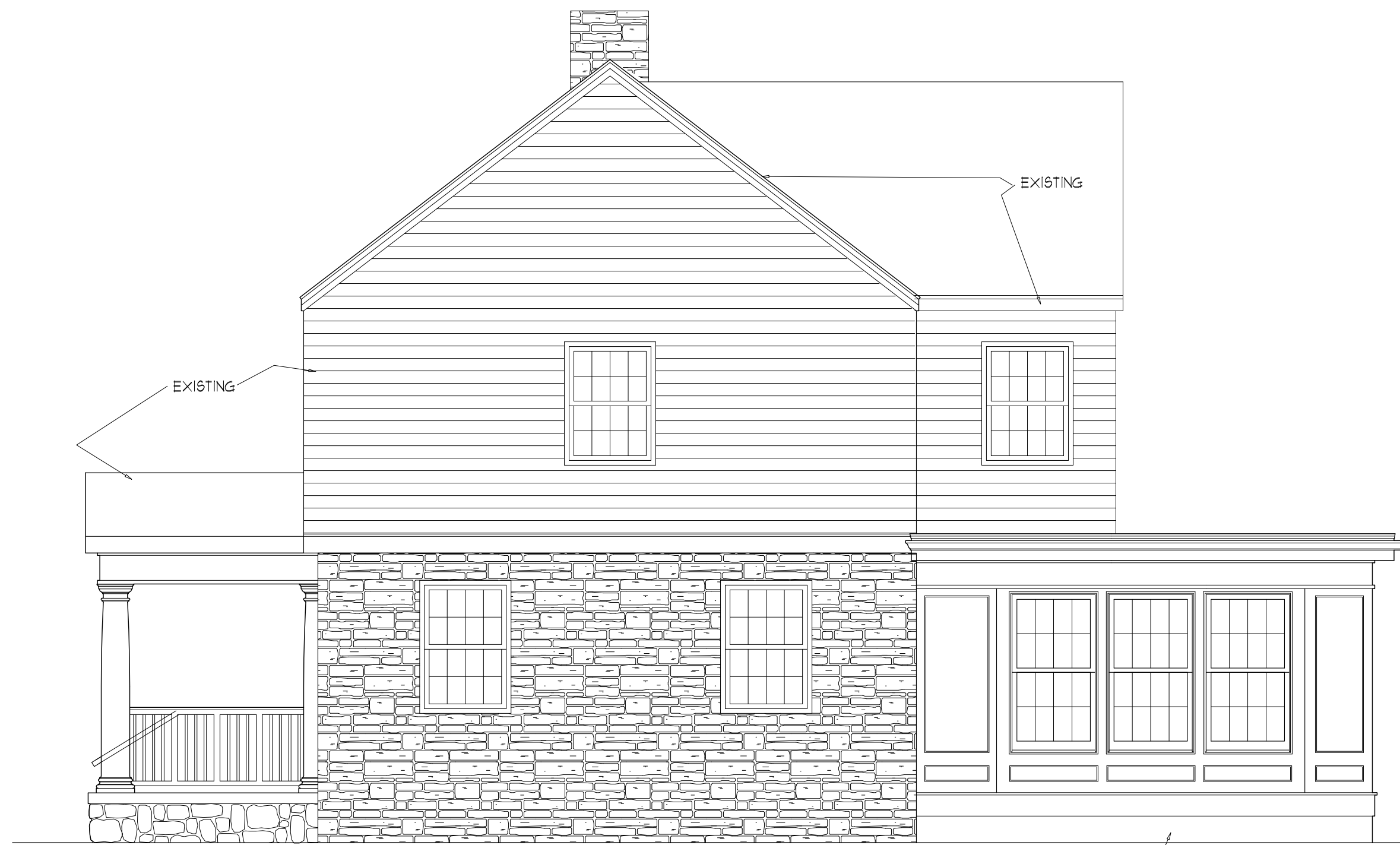
EAST - RIGHT ELEV. 1/4" = 1'-0"