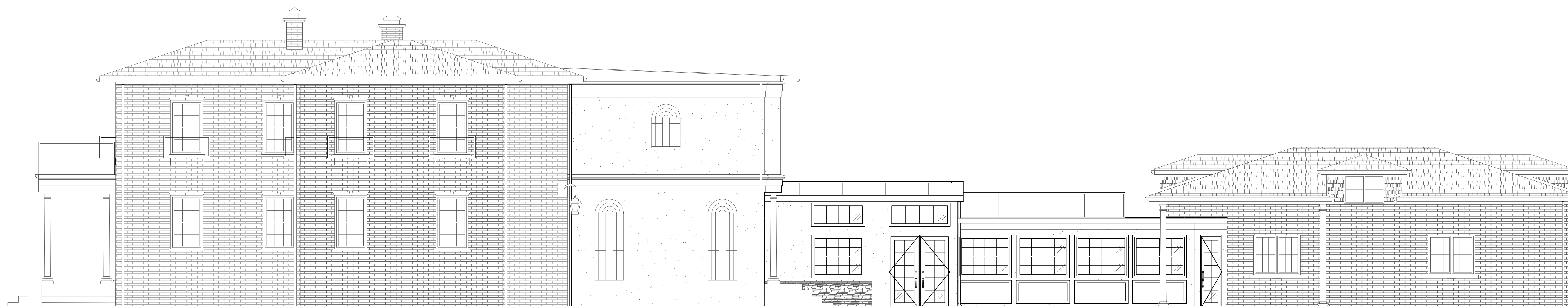
B SOUTH ELEVATION SCALE: N.T.S.

z:\projects\2020\clients\contractors\Sullivan Builders\Project Files\Gocken Ruch Residence\Architectural\01\2021\A2.2.dwg, 1/28/2021 5:59:20 PM