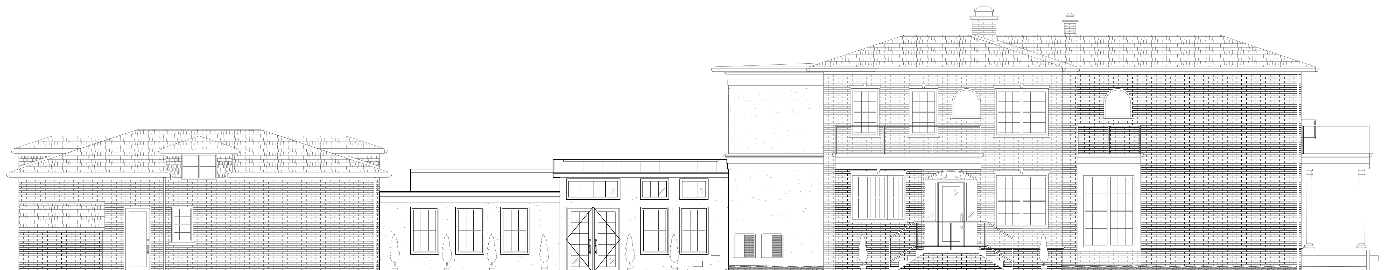
A NORTH ELEVATION SCALE: N.T.S.

Gocken Ruch Residence Kitchen / Connector Remodel