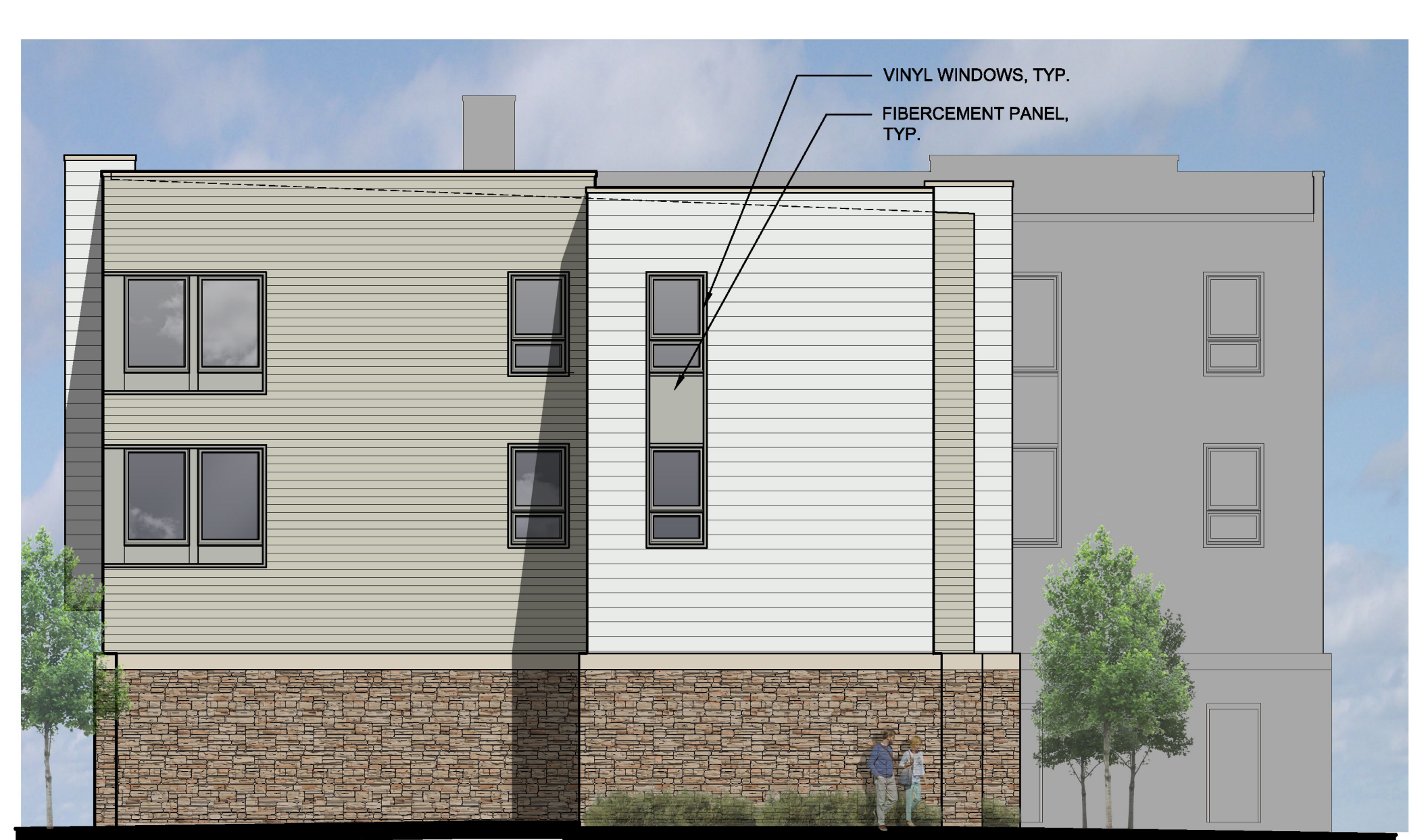
6 SOUTH ELEVATION A2.11 SCALE: 1/8" = 1'-0"