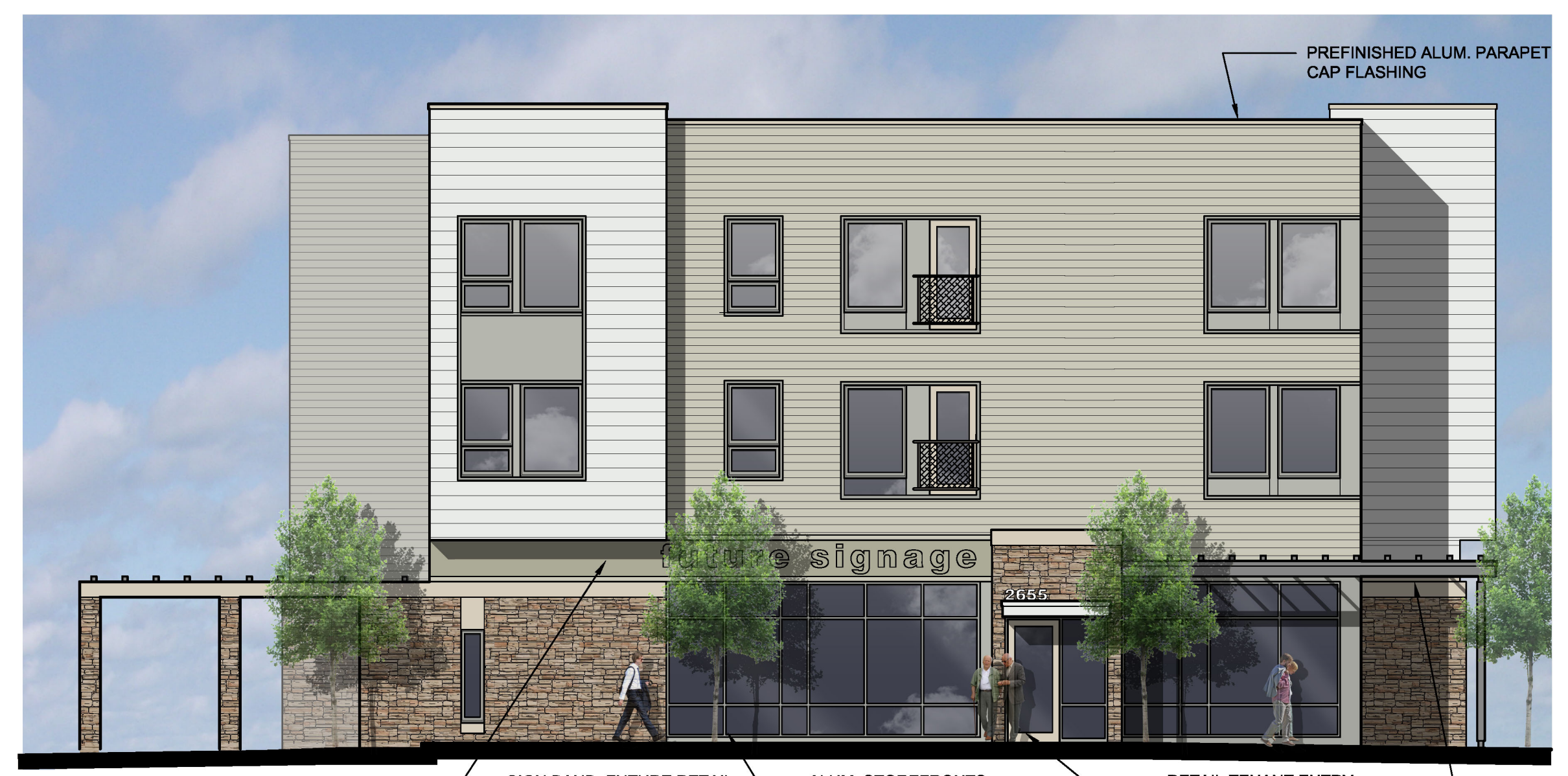
3 NORTH ELEVATION (COLUMBUS AVENUE) A2.11 SCALE: 1/8" = 1'-0"