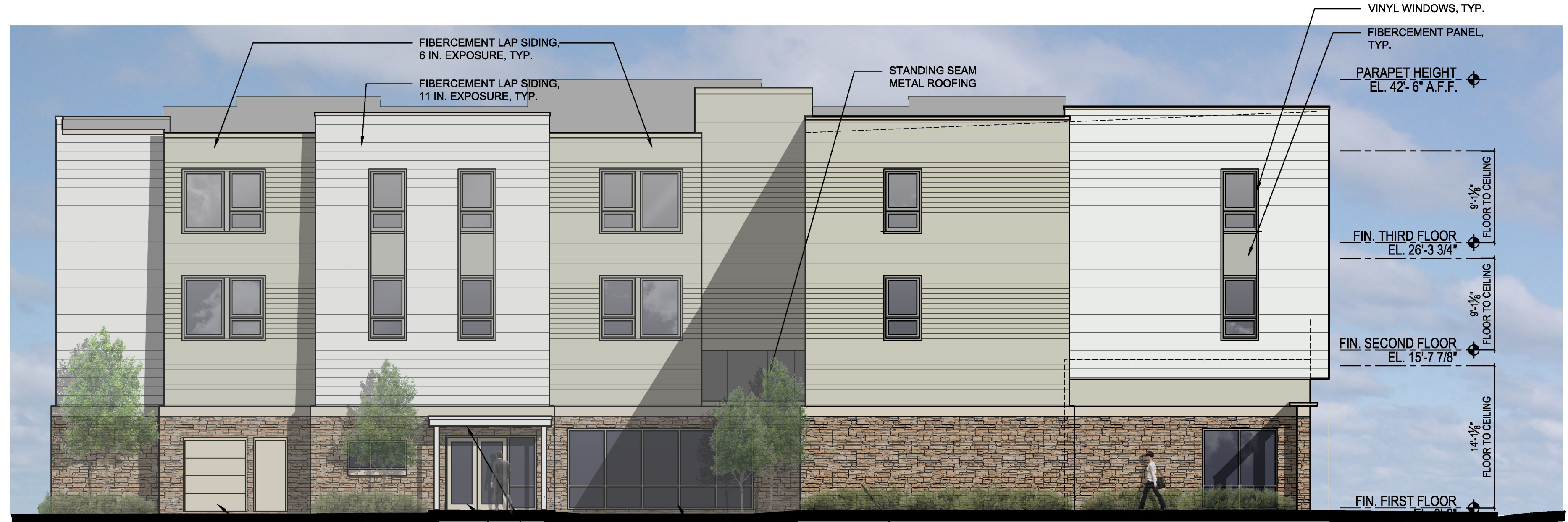
5 EAST ELEVATION (BUILDING REAR, FACING ALLEY) A2.11 SCALE: 1/8" = 1'-0"