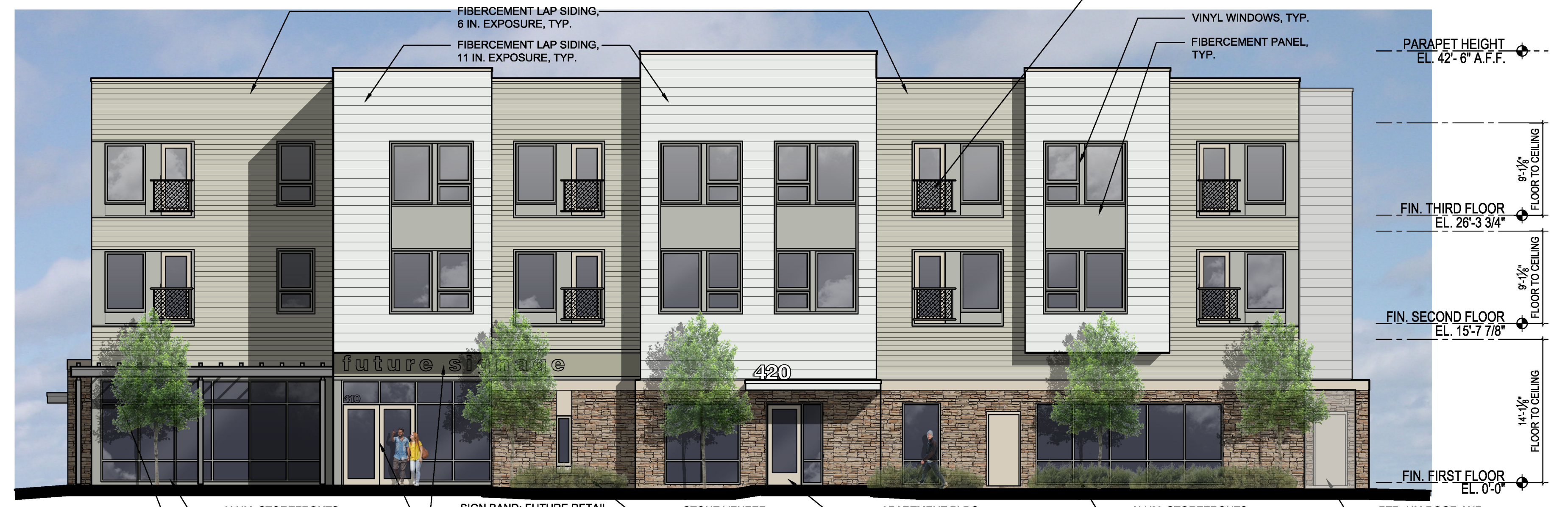
4 WEST ELEVATION (NORTH CASSADY AVENUE) A2.11 SCALE: 1/8" = 1'-0"