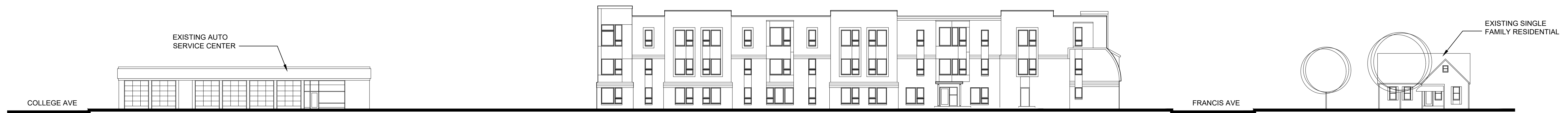
1 E. LIVINGSTON AVE ELEVATION A2.21 SCALE: 1" = 20'-0"