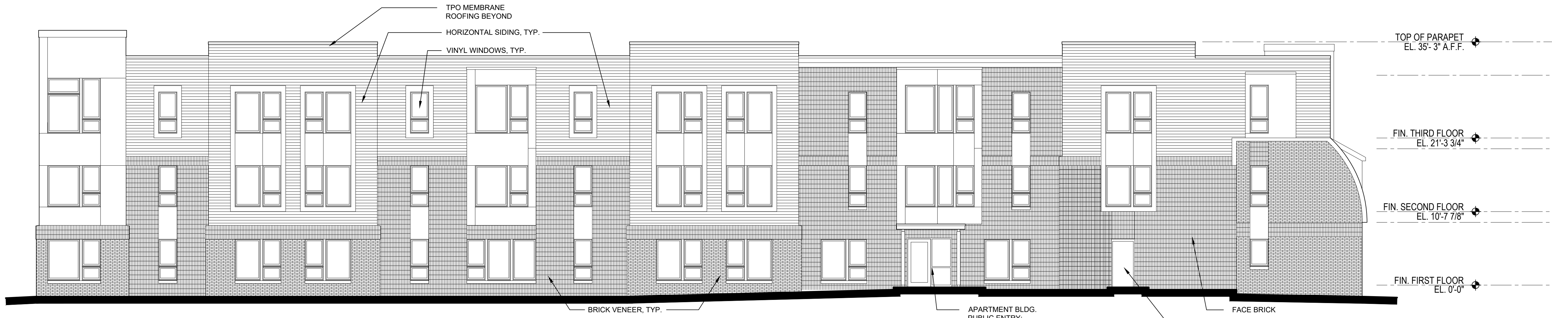
3 SOUTH ELEVATION (LIVINGSTON AVENUE) A2.21 SCALE: 1/8" = 1'-0"