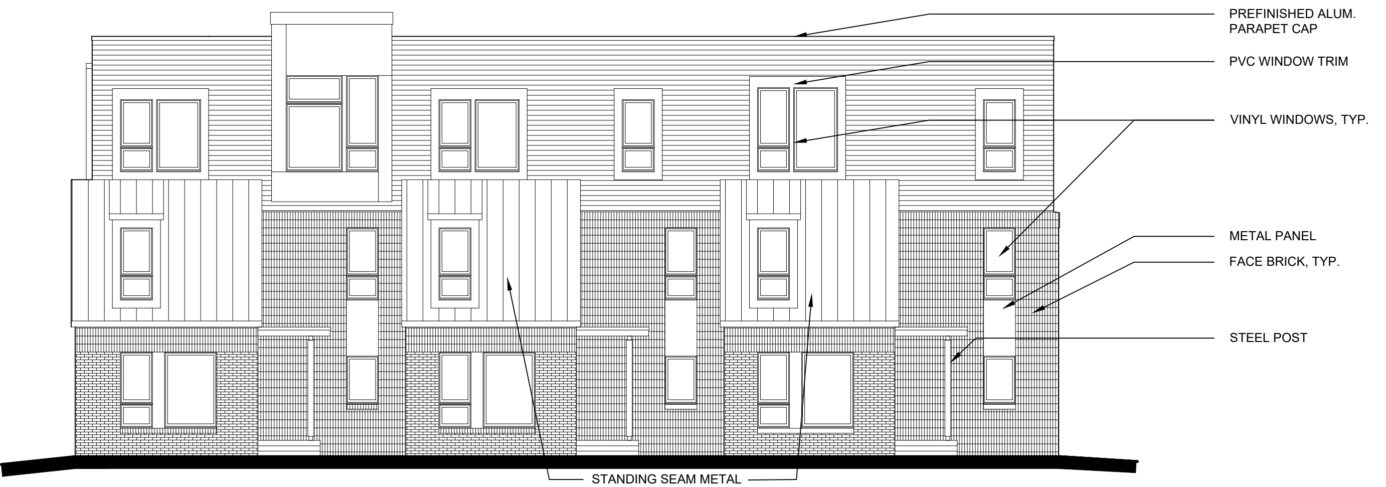
4 EAST ELEVATION (FRANCIS AVENUE) A2.21 SCALE: 1/8" = 1'-0"