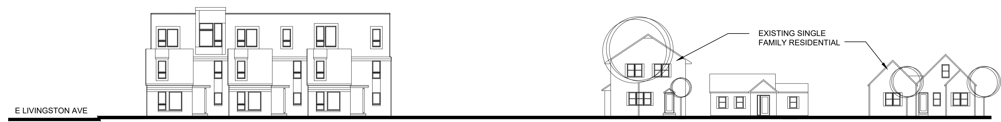
2 FRANCIS AVE ELEVATION A2.21 SCALE: 1" = 20'-0"