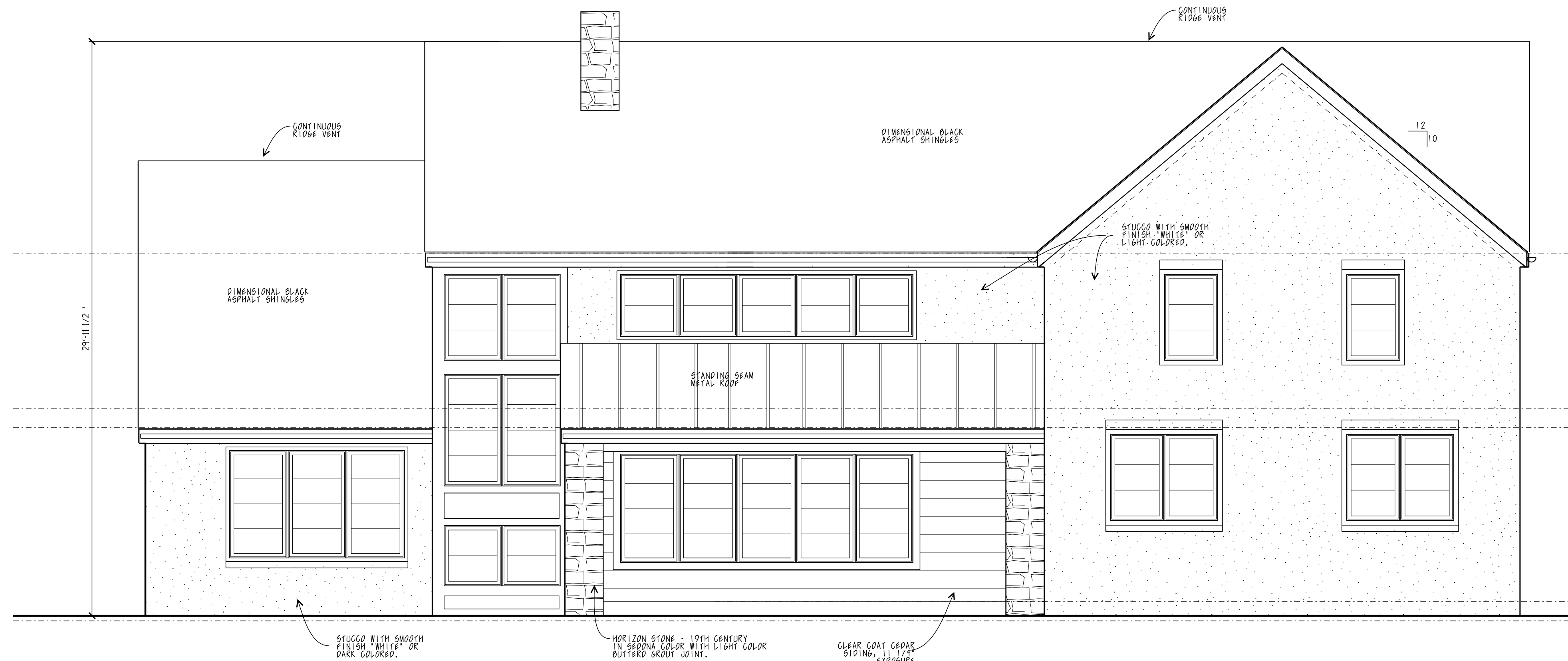
PROPOSED EAST ELEVATION SCALE: 1/4" = 1'-0"