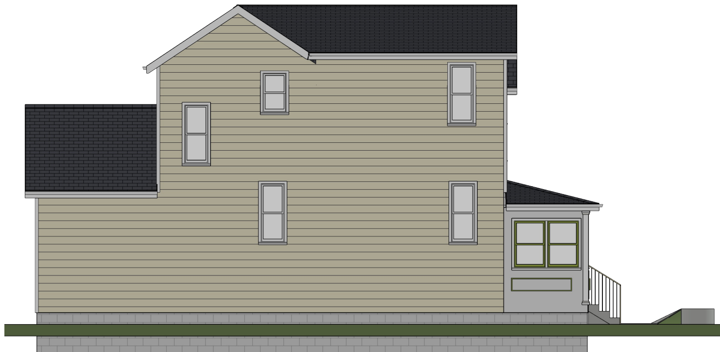
PROPOSED LEFT ELEVATION