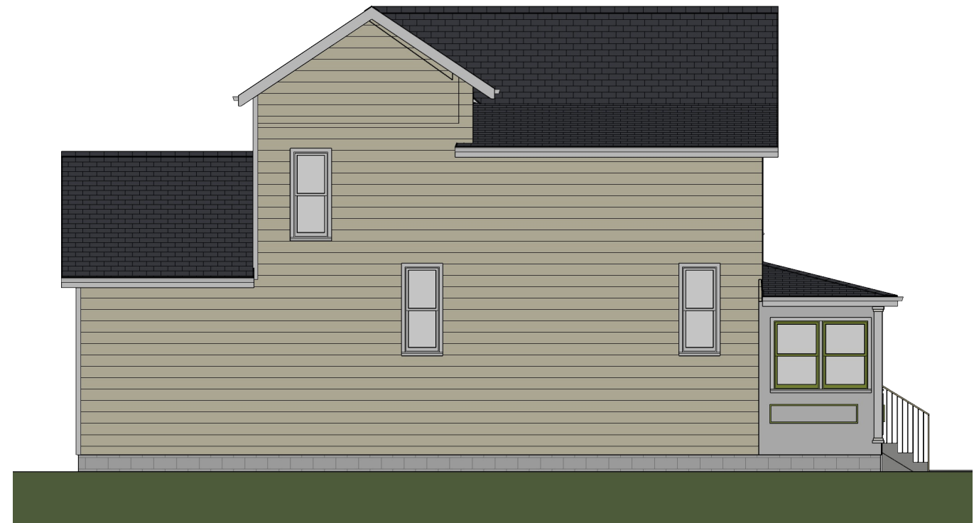
EXISTING LEFT ELEVATION