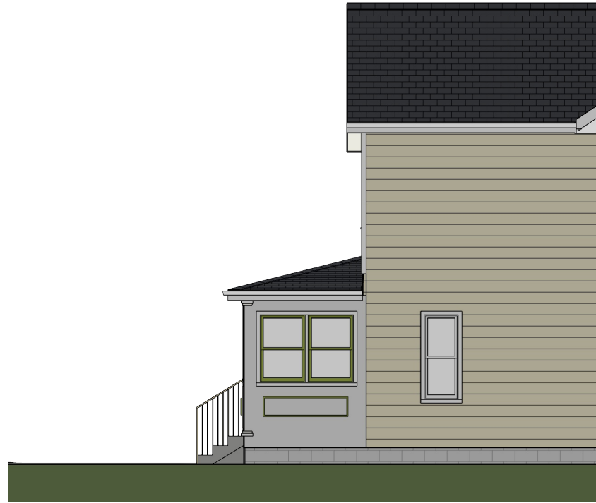
EXISTING RIGHT ELEVATION