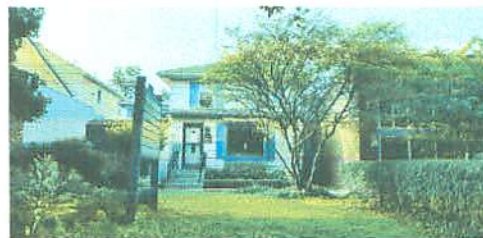
APPARENT ENCROACHMENTS: NONE.

TITLE COMPANY: CLEAN TITLE AGENCY, INC. LENDER: N/A BUYER: BEXMAIN LLC/CITY OF BEXLEY SELLER: N/A DATE: 09/14/2020 ORDER NO.: 0895-20