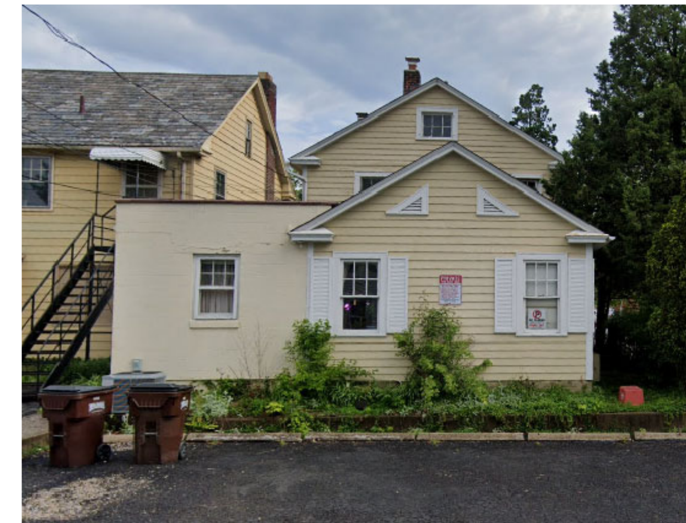
3 2483 REAR NO SCALE

meyers+associates ARCHITECTURE 232 n third street, 300, columbus oh 43215 1 (614) 221-9433 1 (614) 221-9441 www.meyersarchitects.com