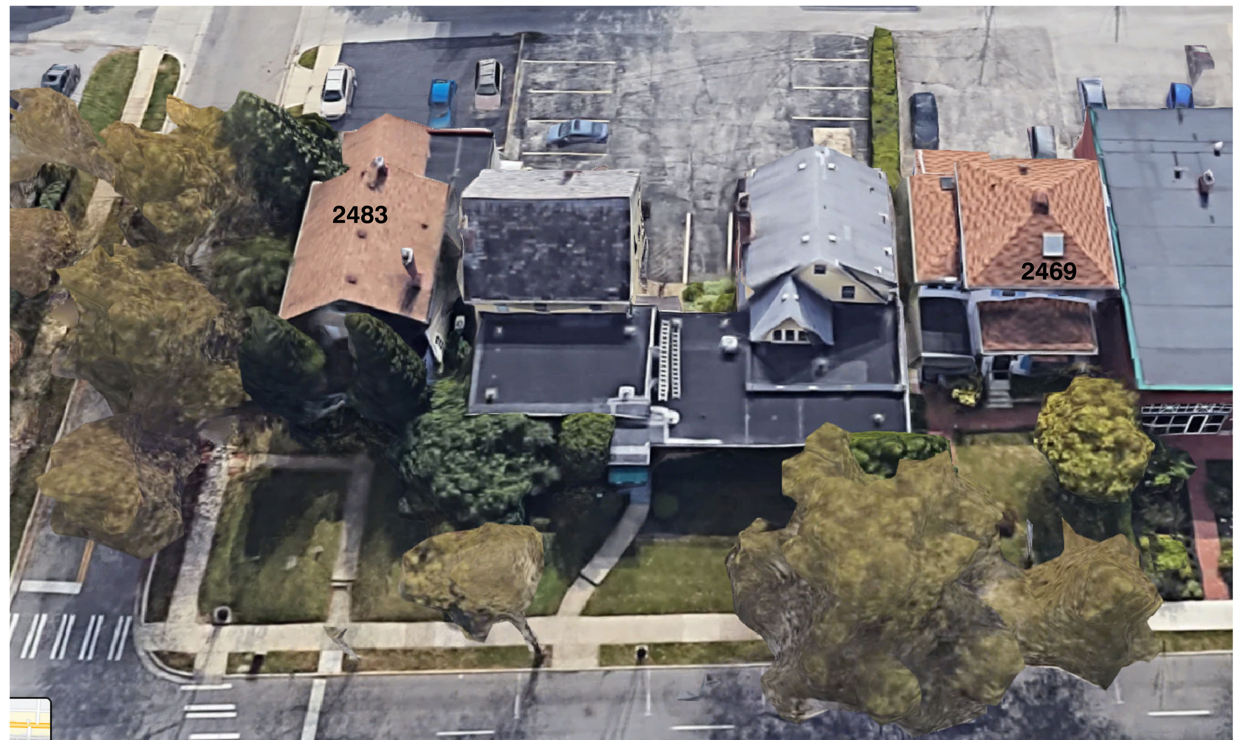
1 NORTH AERIAL NO SCALE