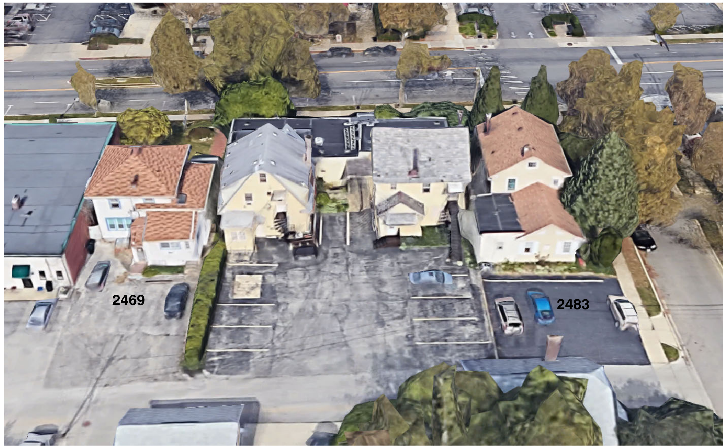
4 SOUTH AERIAL NO SCALE