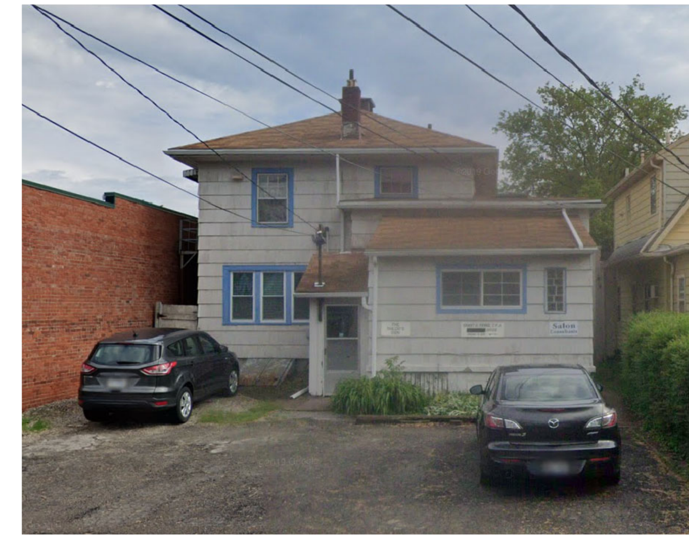
6 2469 REAR NO SCALE