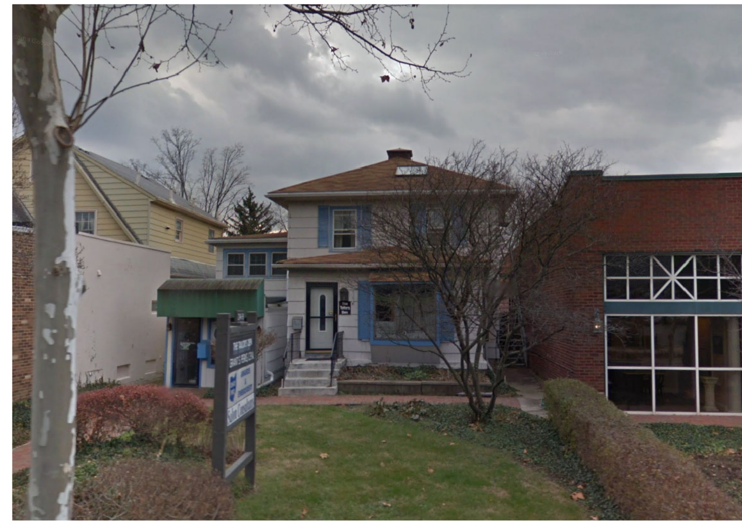
5 2469 FRONT NO SCALE