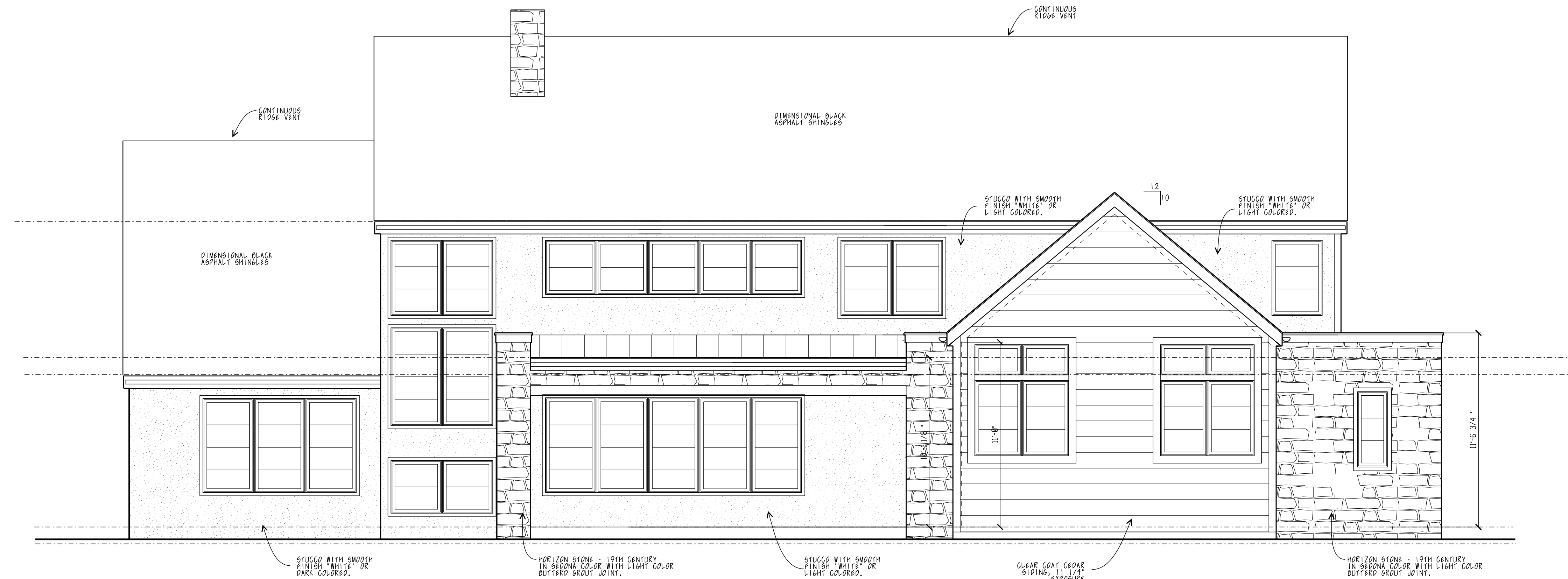
PROPOSED EAST ELEVATION SCALE: 1/4" = 1'-0"