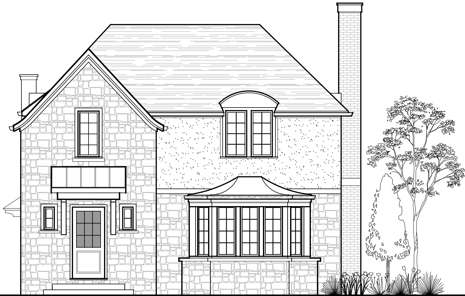
WEST (FRONT) ELEVATION