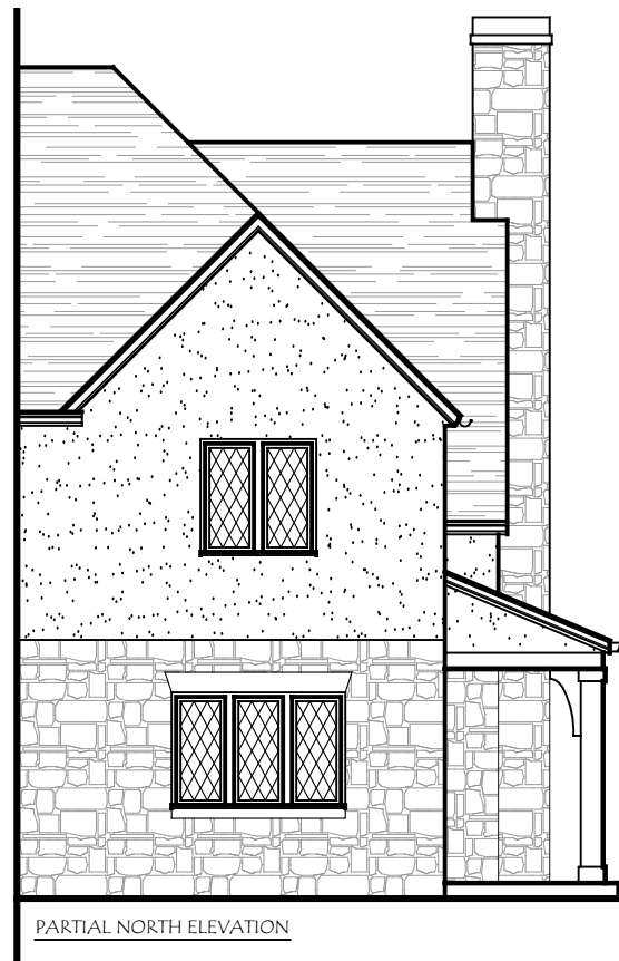
PARTIAL NORTH ELEVATION