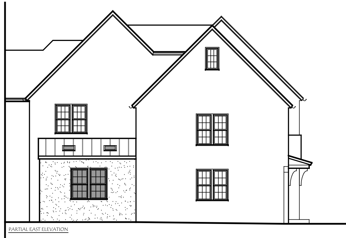
PARTIAL EAST ELEVATION