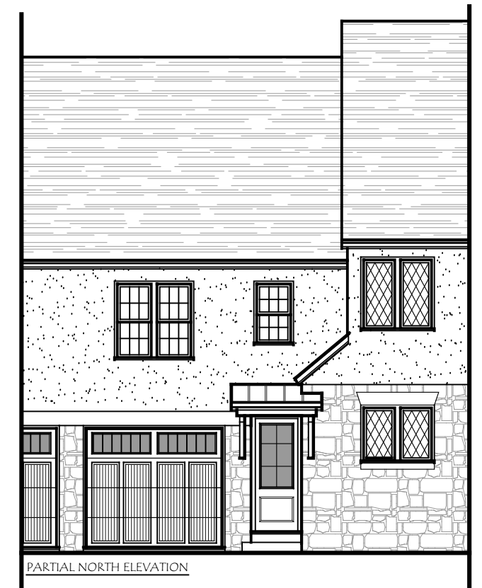
PARTIAL NORTH ELEVATION