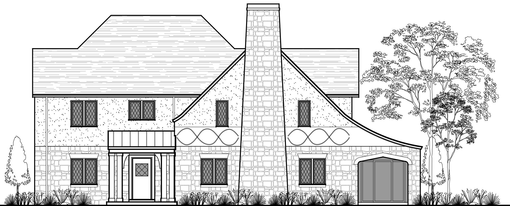
WEST (FRONT) ELEVATION

COPYRIGHT© LAUERHASS ARCHITECTURE, LLC ALL RIGHTS RESERVED. THE ARCHITECT'S DRAWINGS AND OTHER WORK ARE FOR USE SOLELY ON THIS PROJECT. THE ARCHITECT IS THE AUTHOR, AND RESERVES ALL RIGHTS. INFORMATION CONTAINED HEREIN SHALL NOT BE USED WITHOUT THE EXPRESS WRITTEN AUTHORIZATION OF THE ARCHITECT.