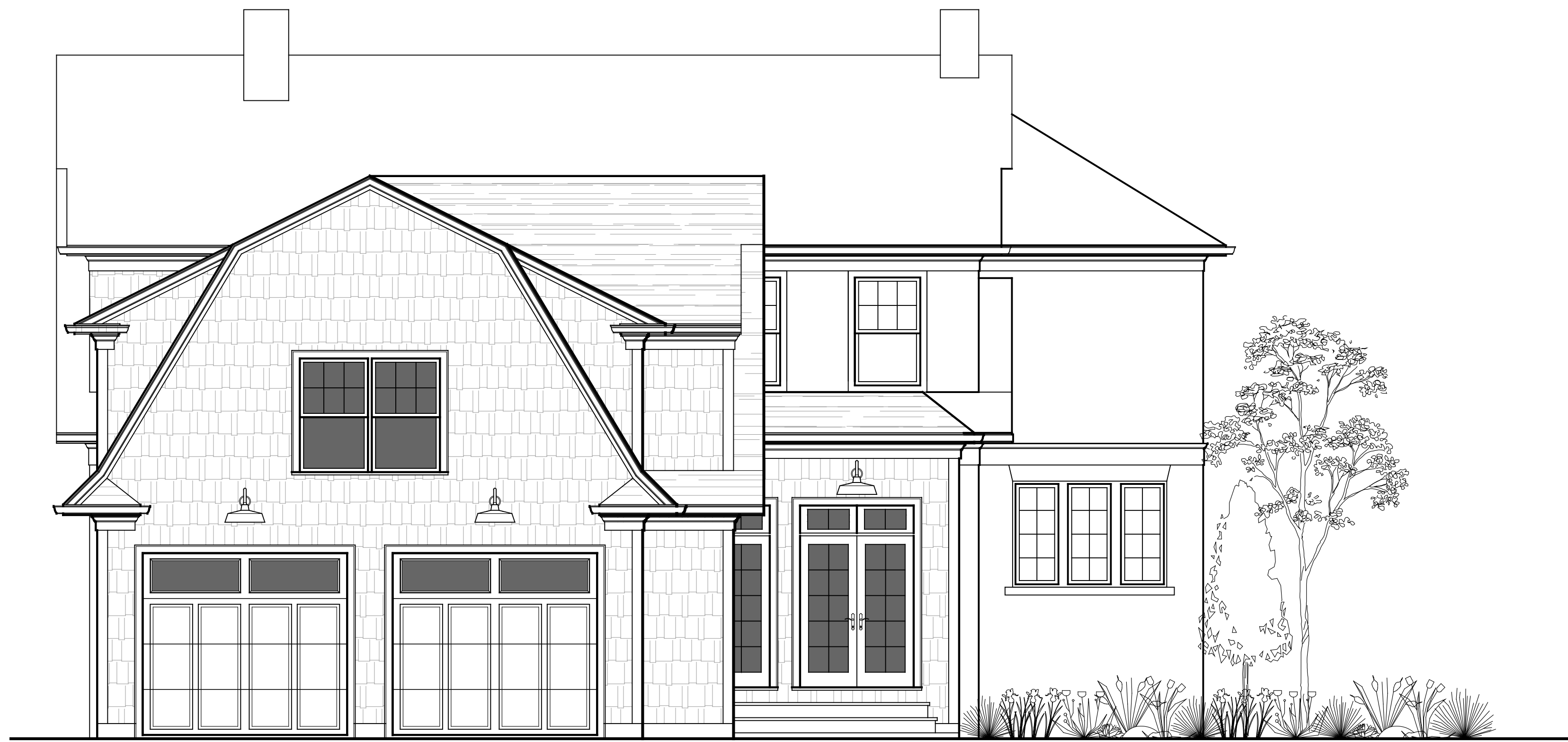
○ West Elevation SCALE: 1/4" = 1'-0"