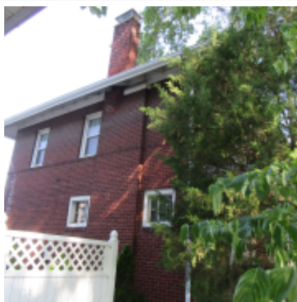
South Elevation Mar 10, 2020

pdf Architectural Plans which include Exterior Elevations and floor plans of existing and proposed Mar 10, 2020