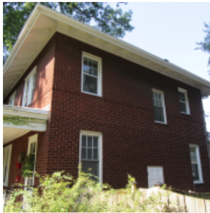
North Elevation Mar 10, 2020