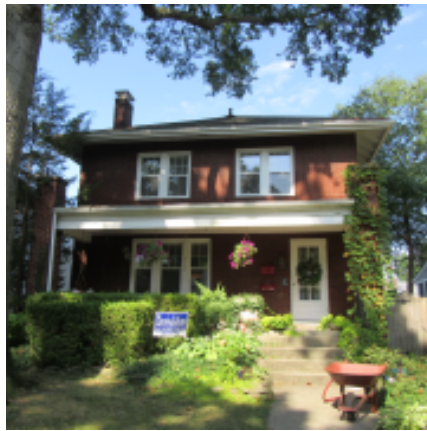
Photographs (required) Mar 10, 2020