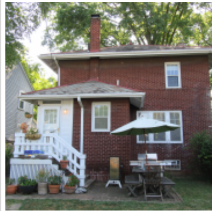
Rear Elevation Mar 10, 2020