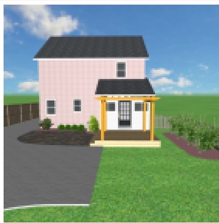
Photographs Mar 06, 2020