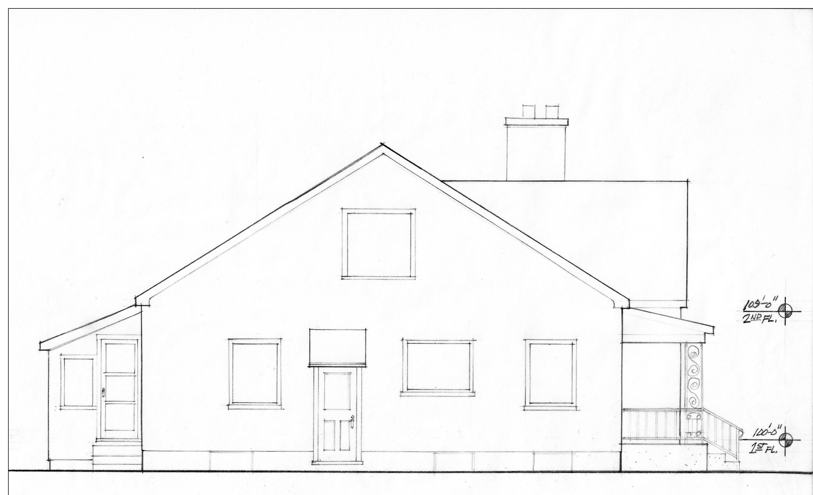
4 NORTH EXTERIOR ELEVATION - EXISTING \frac{1}{4}'' = 1'-0''