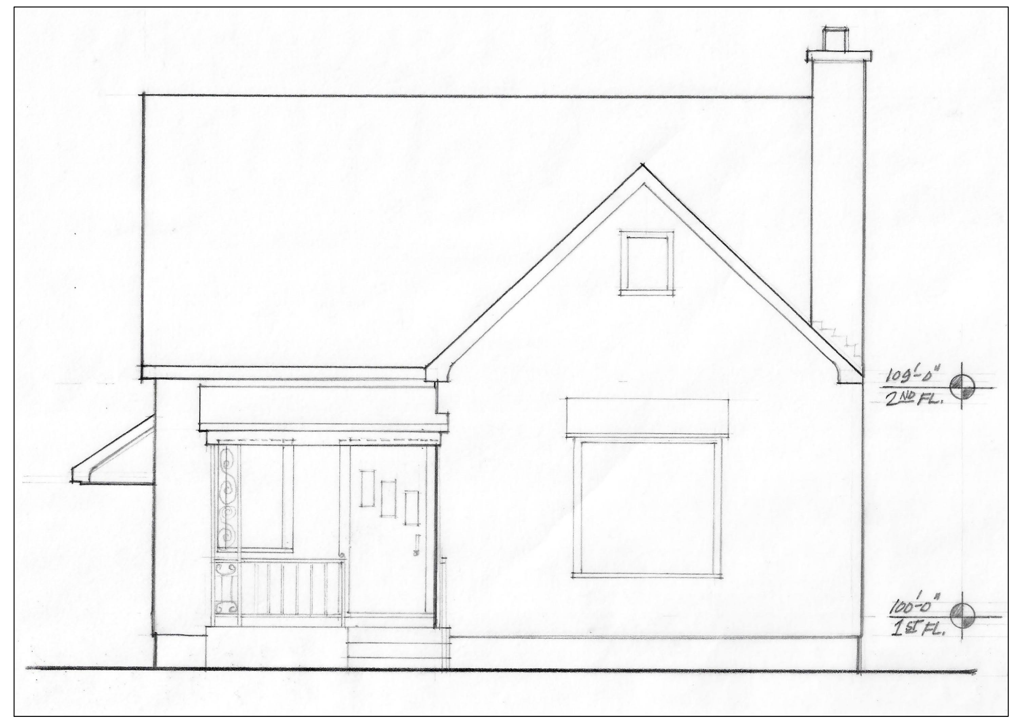
1 WEST EXTERIOR ELEVATION - EXISTING \frac{1}{4}'' = 1'-0''