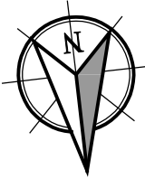
Site Plan SCALE: 1" = 10'-0"