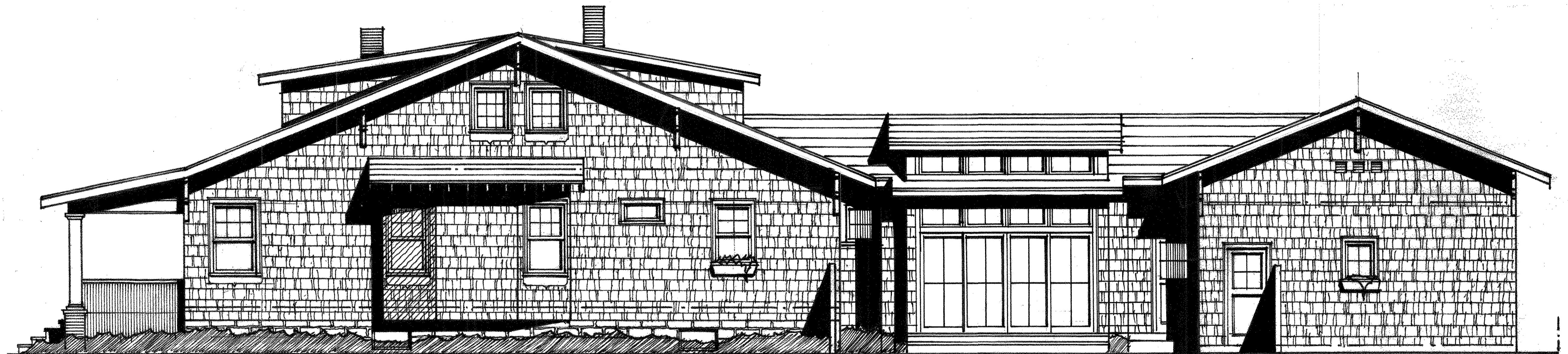
North Elevation 1/4" = 1'-0"