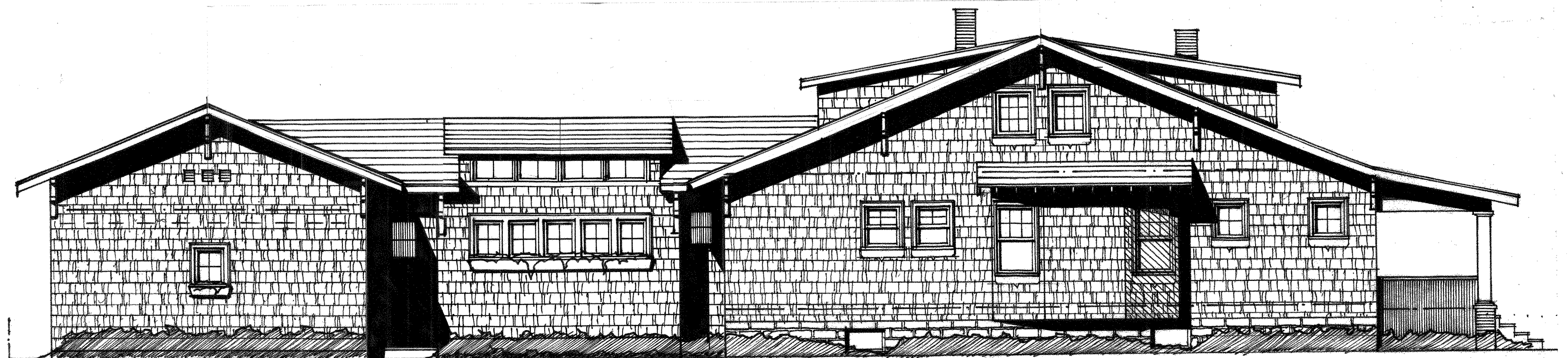
South Elevation 1/4" = 1'-0"