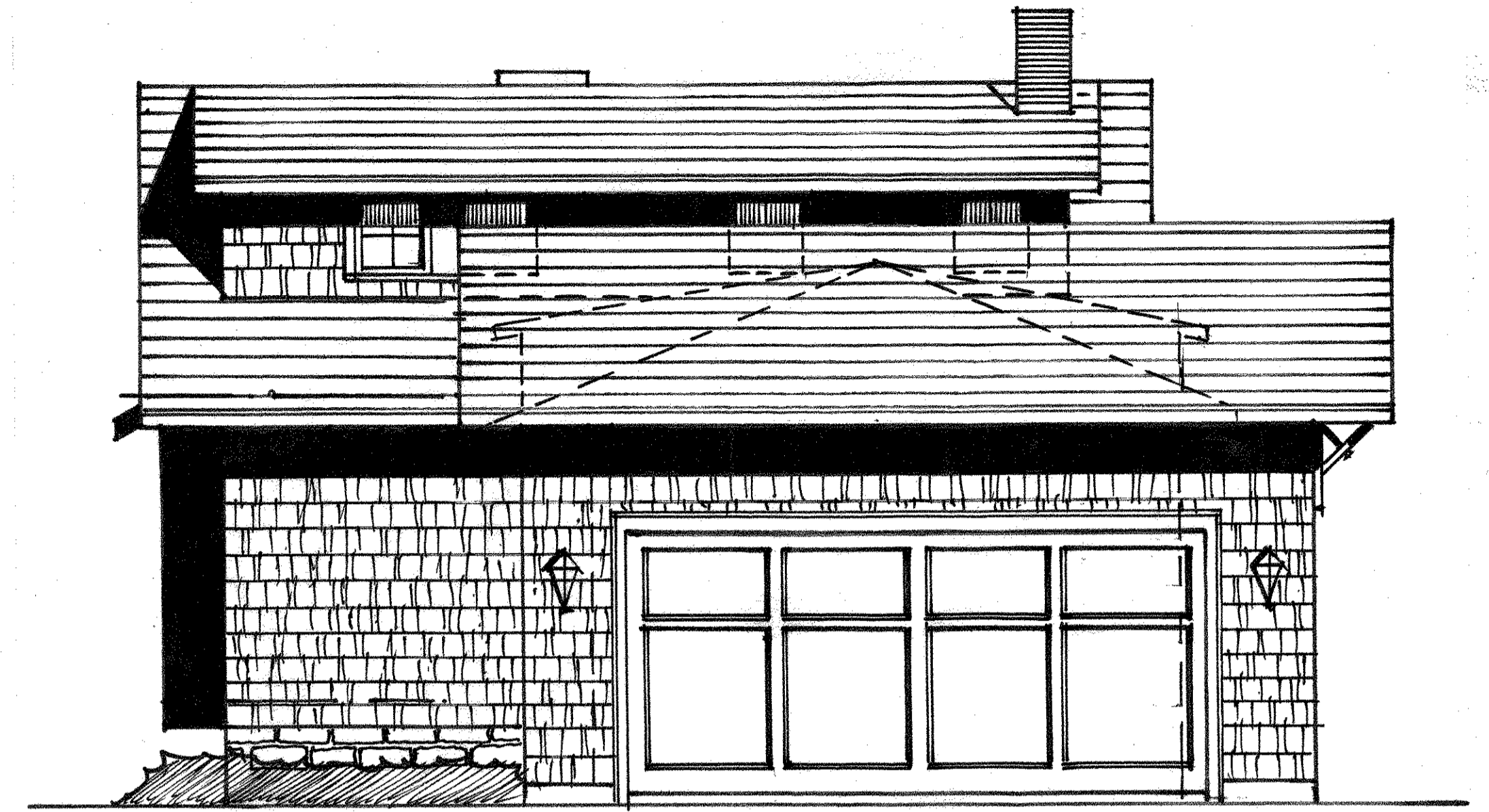
West Elevation 1/4" = 1'-0"