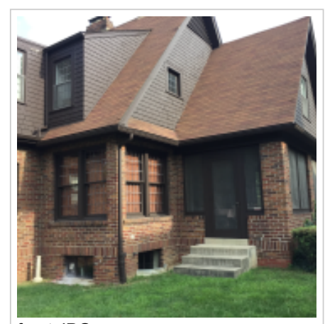
front.JPG Aug 07, 2019