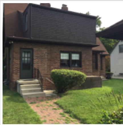
back.JPG Aug 07, 2019