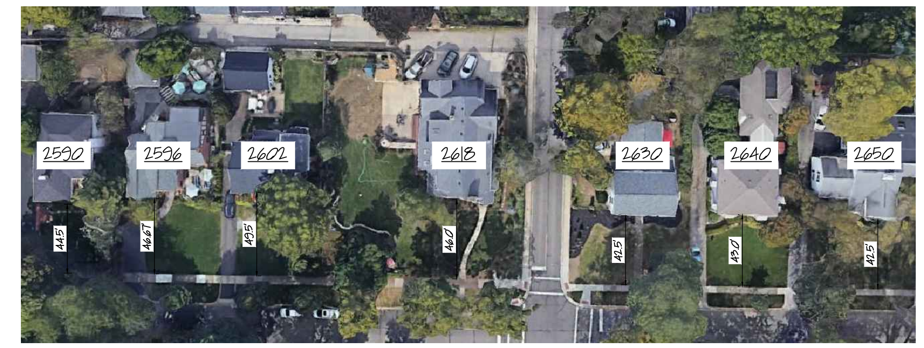
3 AVERAGE SETBACK NO SCALE