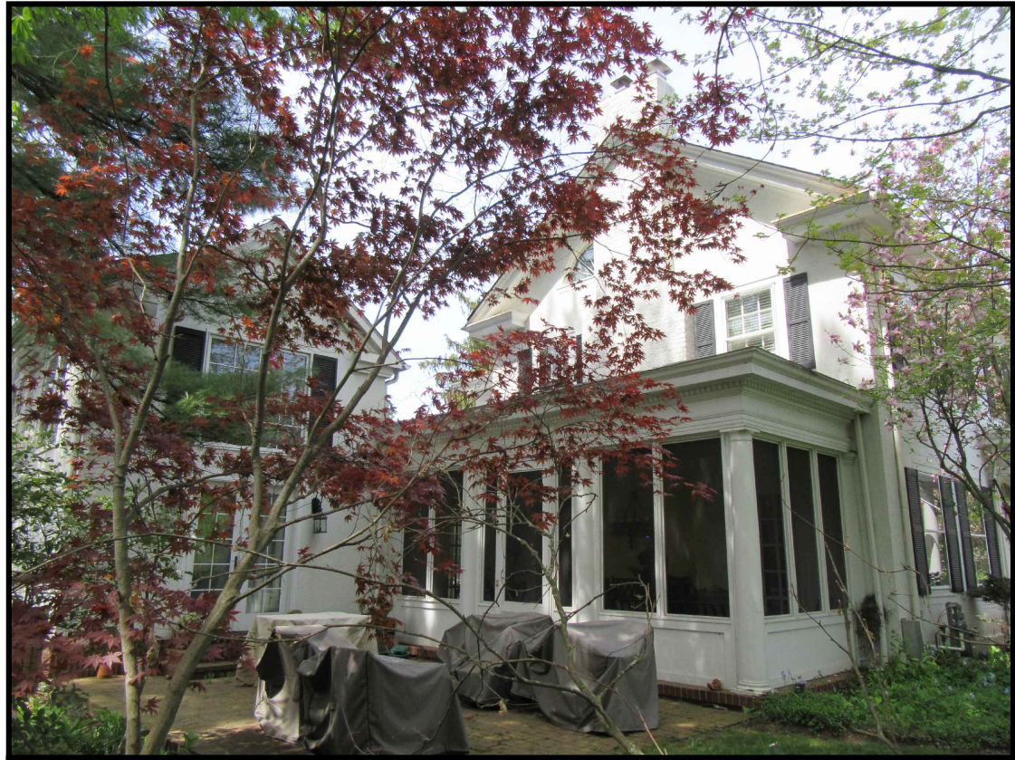
PARTIAL SOUTH ELEVATION