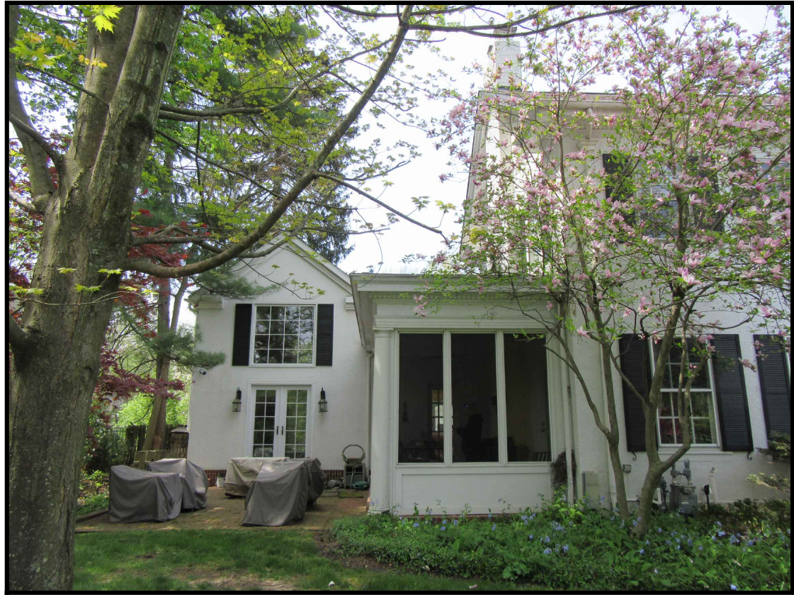
ENLARGED EAST ELEVATION