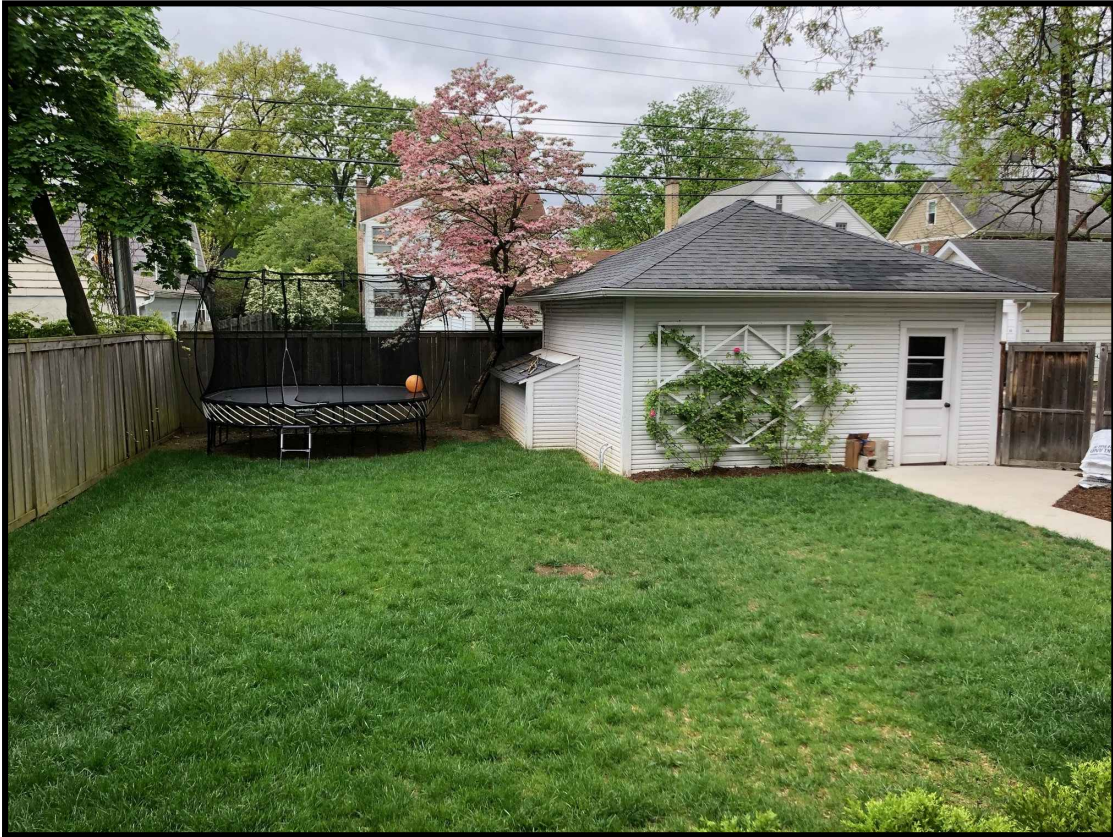
BACK YARD LOOKING WEST

COPYRIGHT© LAUERHASS ARCHITECTURE, LLC ALL RIGHTS RESERVED. THE ARCHITECT'S DRAWINGS AND OTHER WORK ARE FOR USE SOLELY ON THIS PROJECT. THE ARCHITECT IS THE AUTHOR, AND RESERVES ALL RIGHTS. INFORMATION CONTAINED HEREIN SHALL NOT BE USED WITHOUT THE EXPRESS WRITTEN AUTHORIZATION OF THE ARCHITECT.