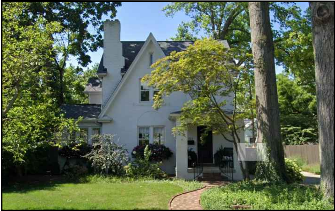
FRONT (WEST) ELEVATION