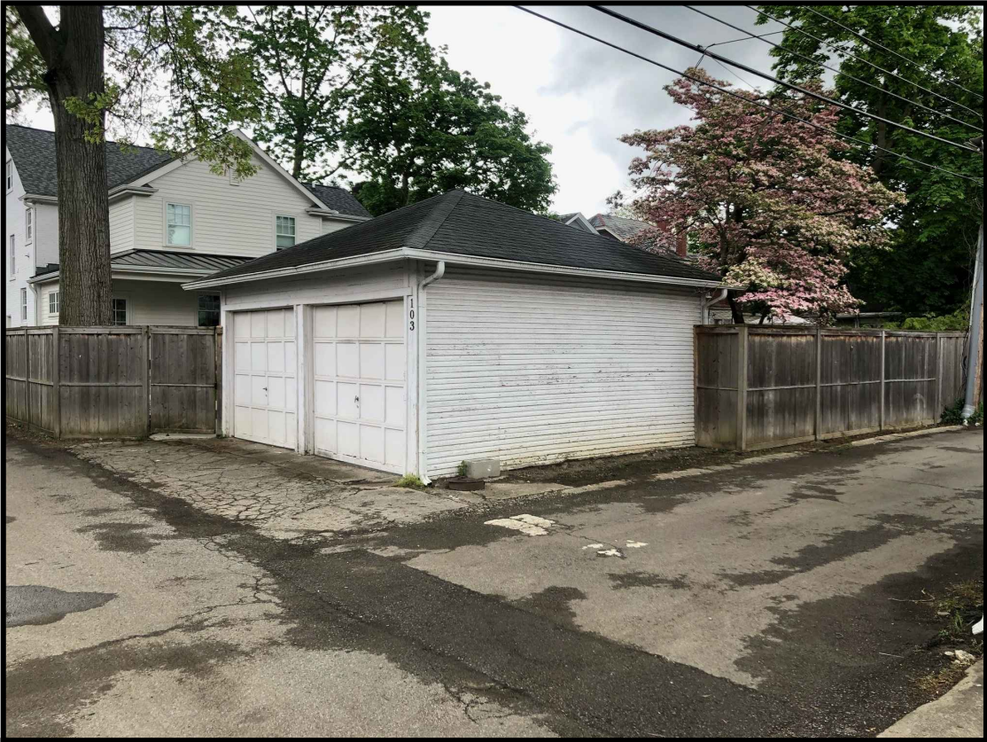
NORTHWEST ALLEY CORNER