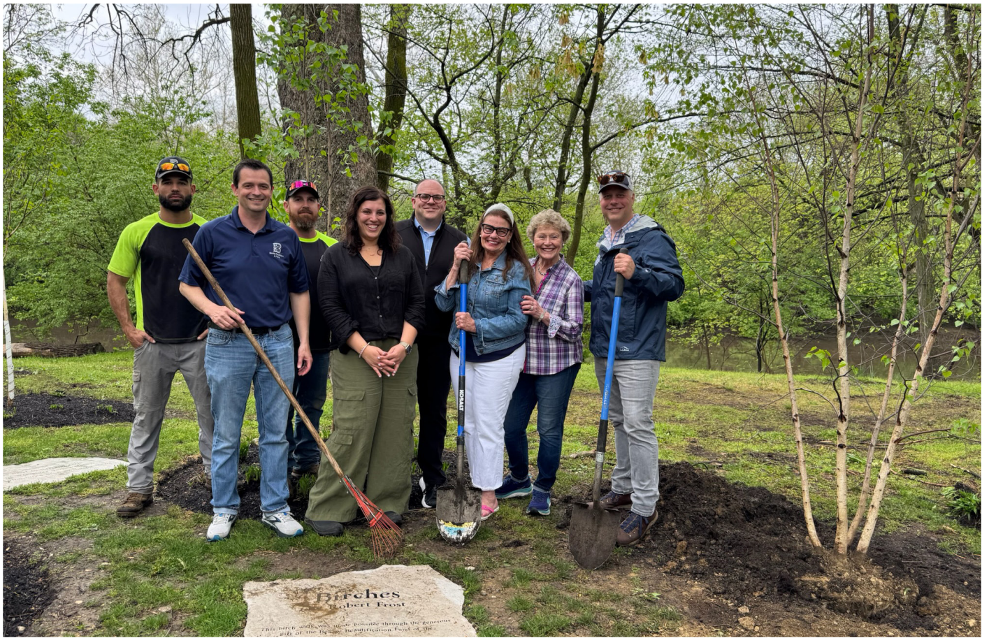
Arbor Day Birch Walk Tree Planting and Dedication