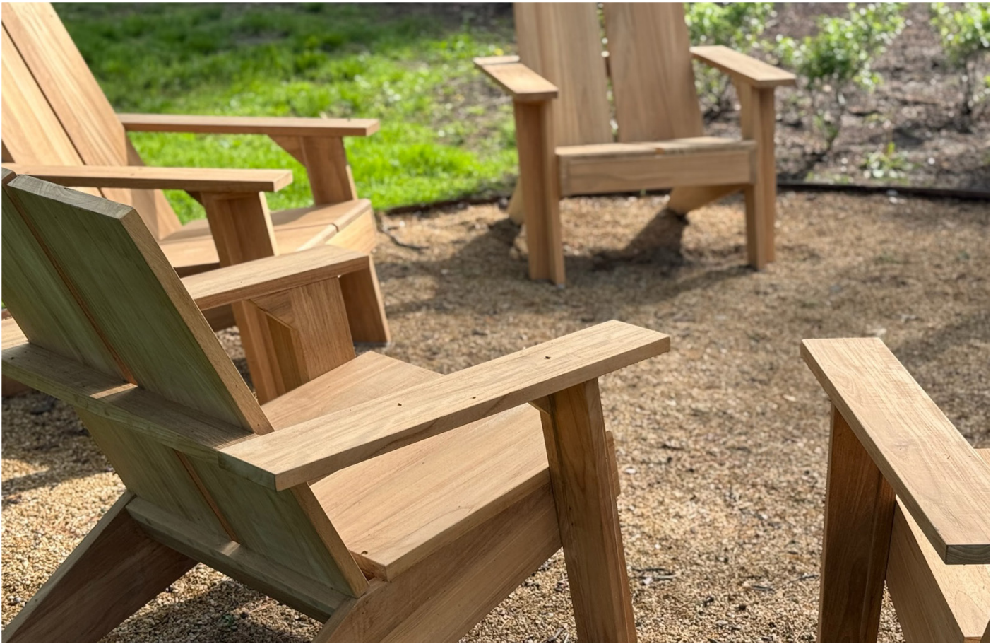
Adirondacks at Commonwealth Pond - thank you BCF!