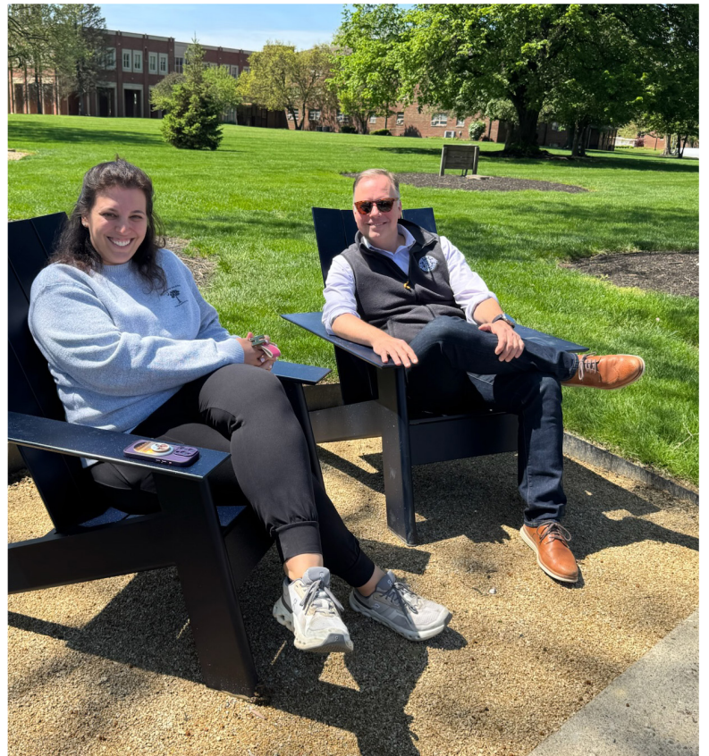
Adirondacks on Main - thank you BCF!