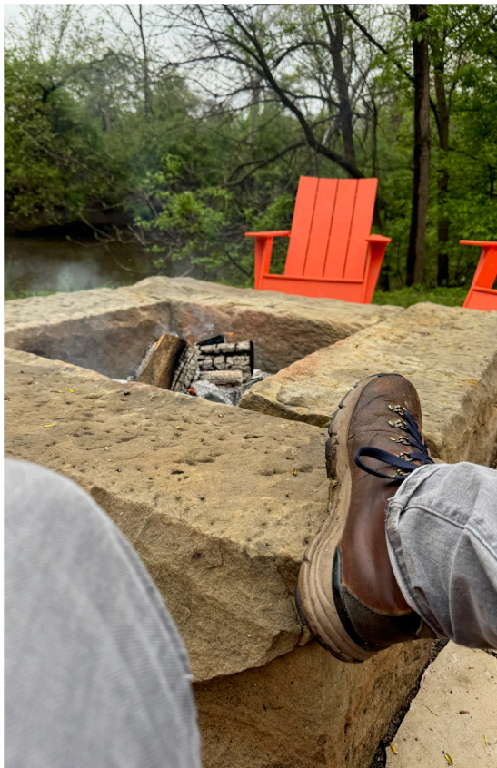
Fire pit at Schneider