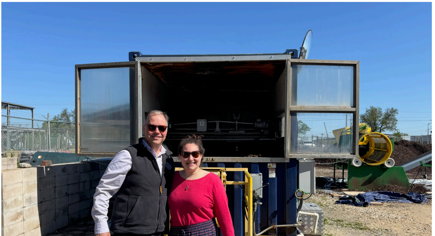
Shipping Container composting at Dayton Food Bank