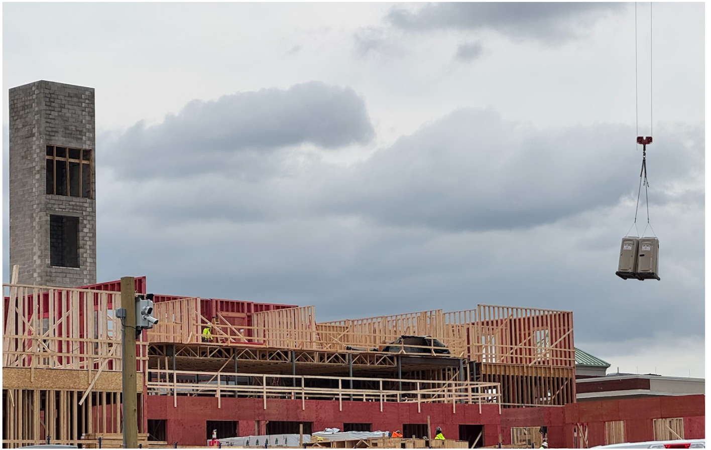
Airborn loos at the Fitzgerald site