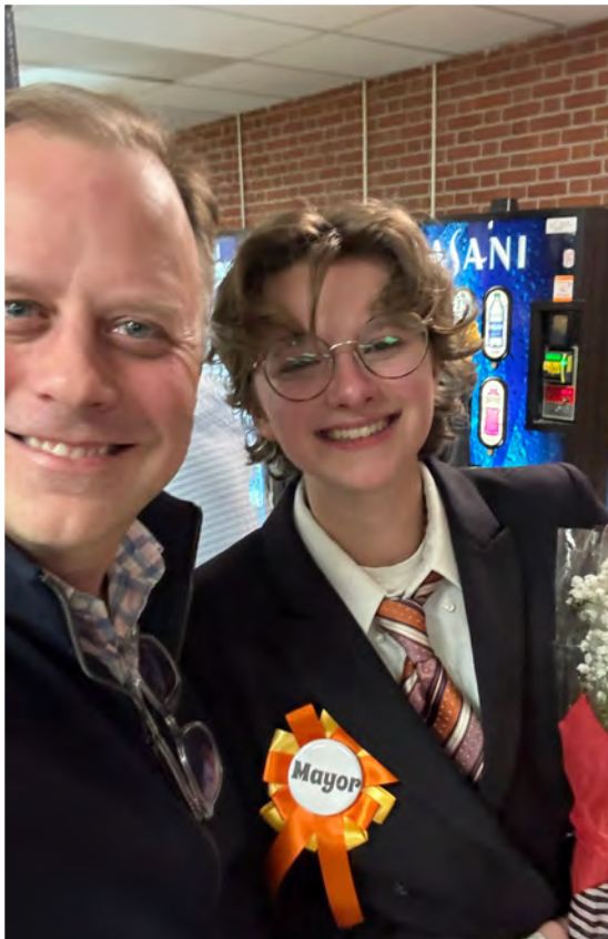
Hanging with Mayor Sal from "Big Fish"