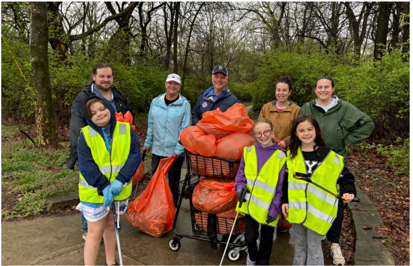
Trash Talking through the rain!