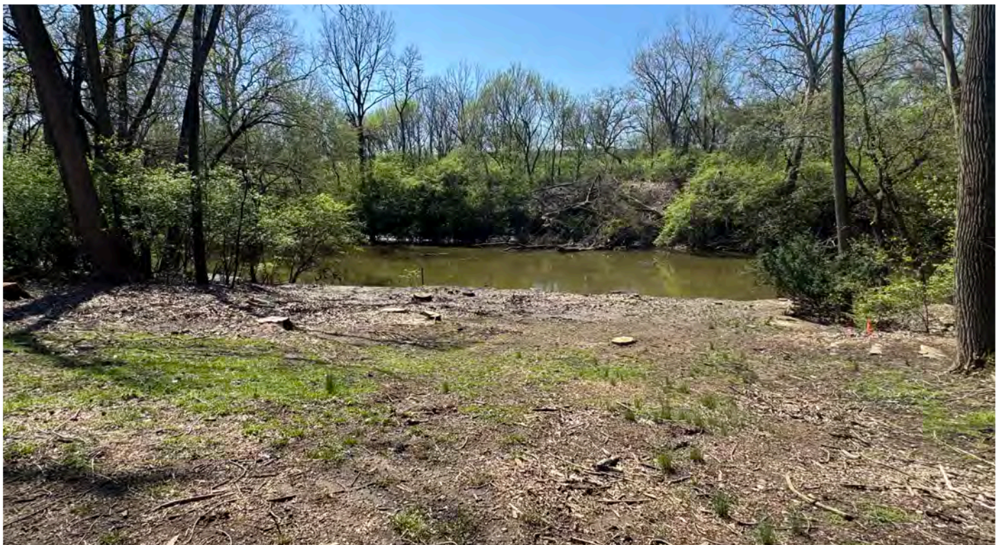
Making way for the upcoming Alum Creek bike and pedestrian bridge