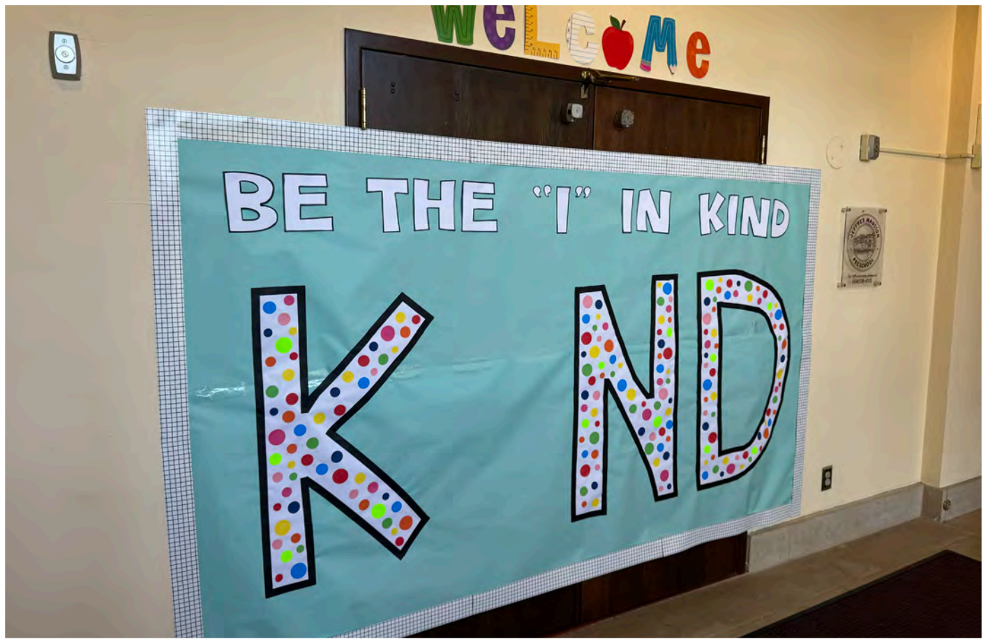
A great reminder from Jeffrey Mansion Preschool