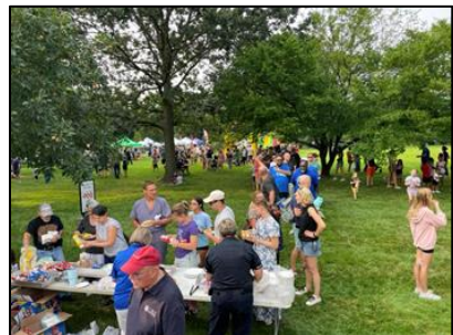
First Annual Bexley National Night Out