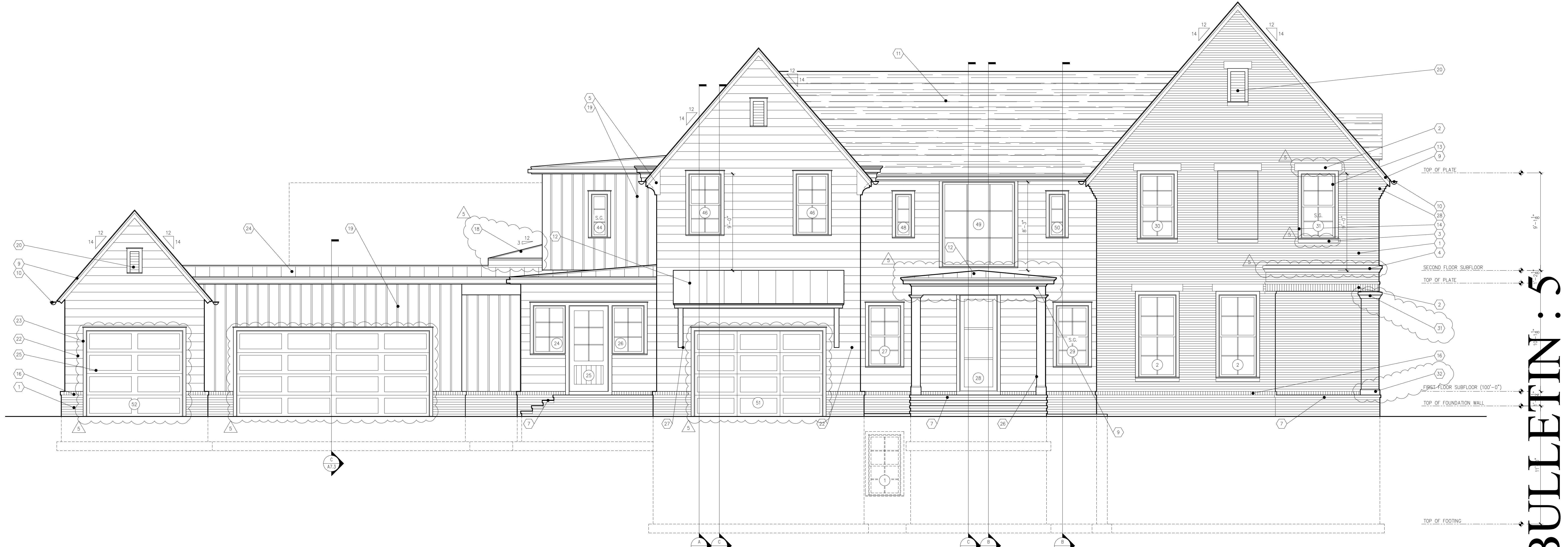
NORTH ELEVATION 1/4" = 1'-0"