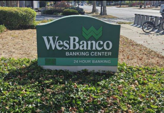
EXISTING MONUMENT SIGN

UL APPLIES TO ILLUMINATED SIGNS ONLY. The location of the disconnect switch after installation shall comply with Section 600.6(A) of the National Electrical Code.