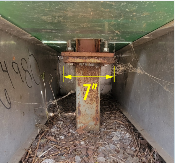
EXISTING POLE / MATCH PLATE