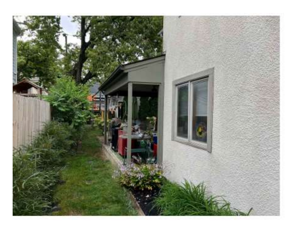
SOUTHWEST PORCH TO BE ENCLOSED

Background R-6 Zoning District – Standard lot size is 50' x 120'