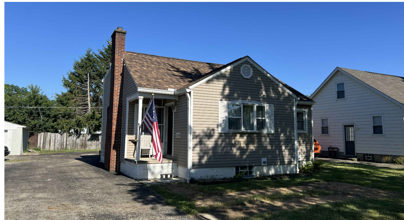
FRONT - EAST