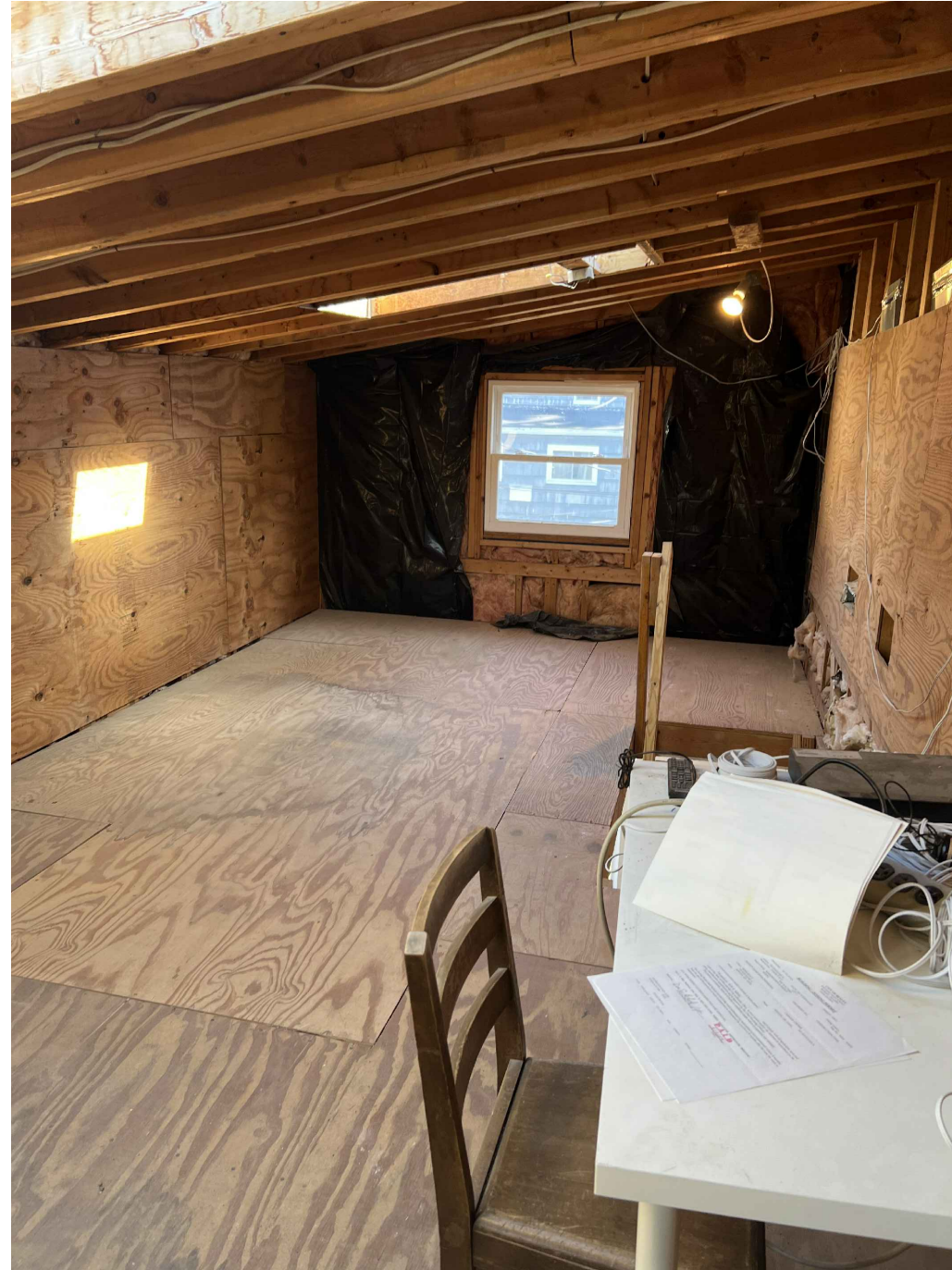
EXISTING BEDROOM 3