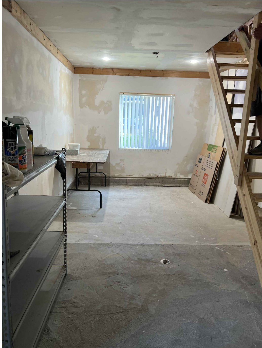
EXISTING MUD ROOM/OFFICE